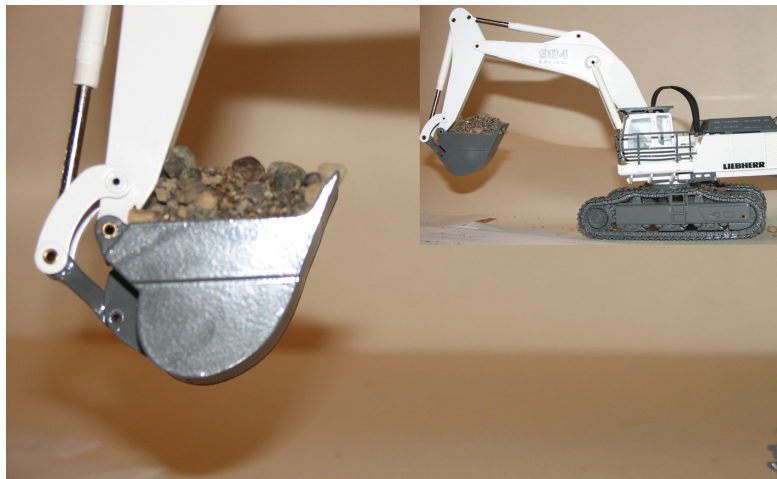
Fig. 3. Bucket fill modeling.