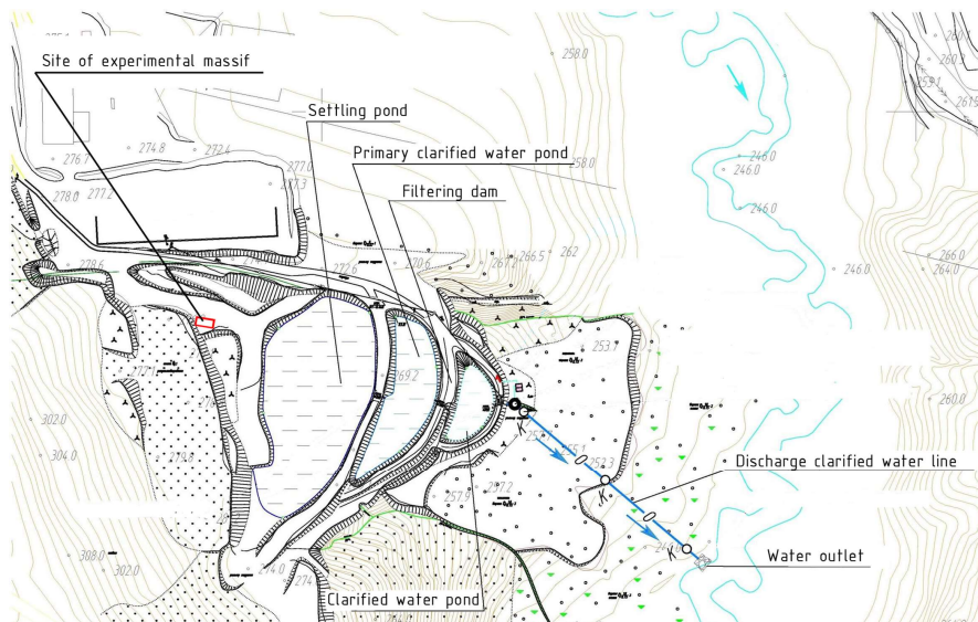
Fig. 2. Choosing the location of the AFM.

A significant number of works [7-17] are devoted to the study of natural sorbents and adsorption processes characteristic of phase separation surfaces. Natural sorbents for effective purification of industrial wastewater from dissolved and very fine (colloidal) mechanical particles can act overburden rocks of the developed deposit, with a high specific surface area. For the conditions of the Kuzbass, it can be highly fractured weathered sandstones and siltstones (including their carbonaceous species), also coal, diluted with overburden rocks to a substandard state. Very high filtration rates give the so-called burnt-out – burnt rocks.