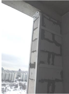
Fig. 3. The example of strengthening the walls of aerated concrete for installing a large window unit

This also applies to the appointment of a constructive solution openings. Very often for the device of external walls energy-efficient stone materials are currently used – foamed and sand-lime concrete, foamed polystyrene, etc. One of the disadvantages of such materials is their low bearing capacity. When erecting walls of a similar design from large-format blocks, you need to strengthen the walls (see figure 3). This has a negative impact on the thermal characteristics of the outer wall.