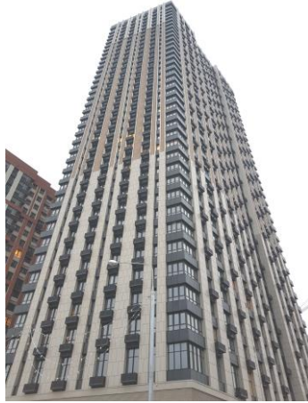
Fig. 1. The example of large-format window units in modern project of residential high-rise building

The high-rise building window design and calculation is much more complicated than similar structures used in multi-storey buildings with a height of less than 75 m. First of all, this is due to the need for additional measures to ensure the safe operation and maintenance of high-rise building windows and high values of wind load on such buildings. Therefore, the purpose of this work is the review of the design problems of high-rise building windows, taking into account their loads and actions.