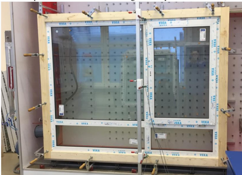
Fig. 4. The appearance of the laboratory stand with the installed sample of a large-format window unit of a high-rise building for testing the resistance to wind loads, air- and water permeability

As noted earlier, for windows of high-rise buildings one of the main factors affecting their construction is the wind load. At present, a simplified engineering method is used to calculate wind loads on windows. Studies show that it has a significant reserve both in strength and in rigidity, and does not take into account the joint work of structural elements of window units [14, 15]. At the same time, it does not take into account the construction features of modern window units. Therefore, for window units of high-rise buildings it is advisable to conduct laboratory tests on the effect of wind loads (see figure 4) on window structures. These tests will allow not only to confirm the compliance of the adopted construction of units with the requirements of existing regulations, but also to check the correctness when selecting their equipment (window hardware, seals) to avoid blowing and leakage of the structure. Laboratory tests on the wind load allow to check the operability of the window after the cyclic impact of the wind load, and to simulate the effect of the wind load on its main operational characteristics during the life cycle of the window.