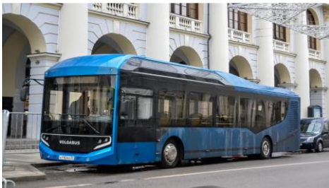
Fig. 5. The electric bus Volgabus City-Rhythm 12E (Vladimir).

Electric buses Volgabus City-Rhythm 12E (5270E) in 2017...2018 passed tests in cities of Central Federal District, Volga Federal District, Siberian Federal District and Ural Federal District. One of them worked in test mode in Lipetsk, Volgograd, Vladimir, Tula, Izhevsk, Kazan (fig. 5...6). The second at the same time worked in Novosibirsk, Surgut, Khanty-Mansiysk and Perm.