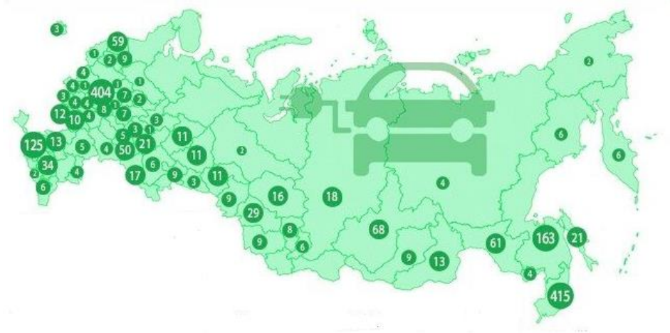
Fig. 2. Localization of electric transport in Russian regions (01. 2018) [4].

Table 1 presents statistics of agency «AUTOSTAT» on/about the most popular models of electric cars in Russia and their predominant localization in regions of country.