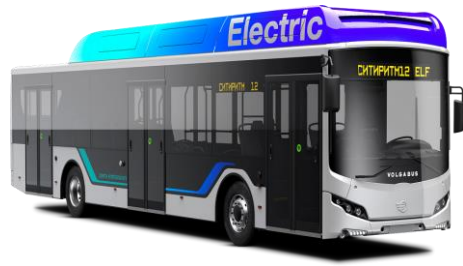
Fig. 6. The electric bus Volgabus City-Rhythm 12E (promotional photo).

At the winter of 2017...2018 in Odintsovo (Moscow region) in SkolTech small class electric bus Next Electro-7720 (fig. 7) was started to be used. In Tyumen during 11 months of 2018 electric bus LIAZ-6274 (fig. 8) worked on city route in operational mode.