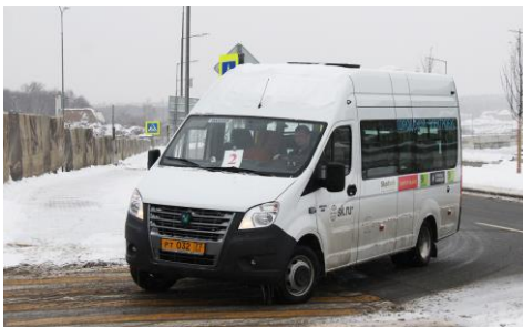
Fig. 7. The electric bus Next Electro-7720 Odintsovo (Moscow region).

At the winter of 2017...2018 in Odintsovo (Moscow region) in SkolTech small class electric bus Next Electro-7720 (fig. 7) was started to be used. In Tyumen during 11 months of 2018 electric bus LIAZ-6274 (fig. 8) worked on city route in operational mode.