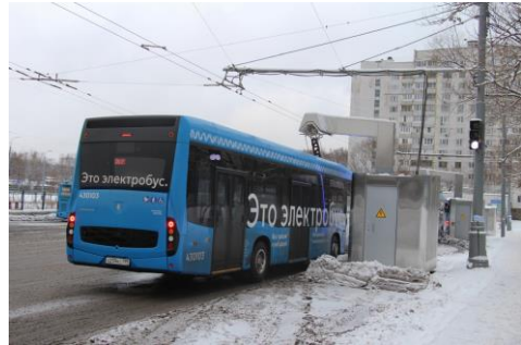
Fig. 11. The electric bus KAMAZ-6282 (Moscow).