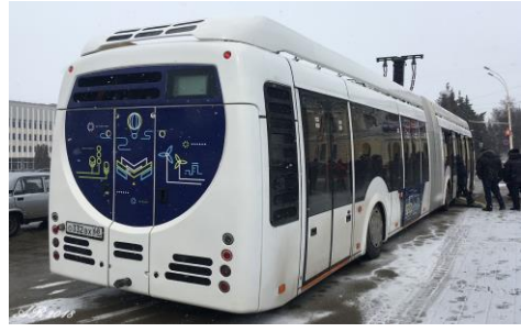
Fig. 10. The electric bus BKM U 433 Vitovt Max Electro (Tambov).

In May 2018 Moscow City Hall held a tender for procurement of 200 electric buses. As a result of competition production and delivery of electric buses for Moscow was equally divided between JSC «KAMAZ» and JSC «Russian Buses - GAZ Group». Contract value of one electric bus is 33 mln. rub., however general cost of 200 electric buses is 12,7 bln. rub. That sum also covers construction of 62 charging stations and technical service of buses and infrastructure during next fifteen years.