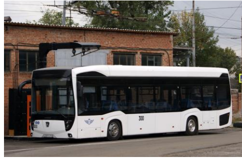
Fig. 4. The electric bus KAMAZ-6282 (Rostov-on-don).

Electric buses Volgabus City-Rhythm 12E (5270E) in 2017...2018 passed tests in cities of Central Federal District, Volga Federal District, Siberian Federal District and Ural Federal District. One of them worked in test mode in Lipetsk, Volgograd, Vladimir, Tula, Izhevsk, Kazan (fig. 5...6). The second at the same time worked in Novosibirsk, Surgut, Khanty-Mansiysk and Perm.