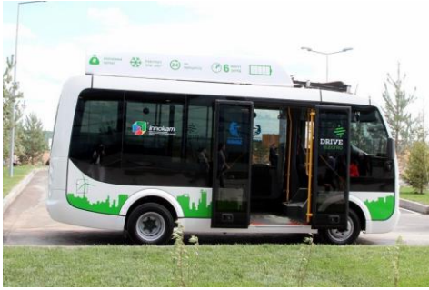
Fig. 3. The electric bus KAMAZ-2257E (Naberezhnye Chelny).