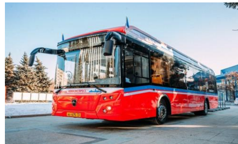
Fig. 8. The electric bus LiAZ-6274 (Tyumen).

In Saint-Petersburg and Tambov electric buses BKM U 433 Vitovt Max Electro (JSC «Belkommunmash») still have been testing.