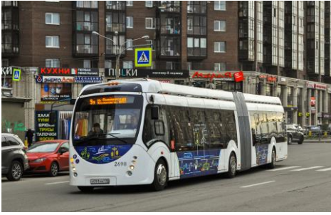
Fig. 9. The electric bus BKM U 433 Vitovt Max Electro (Saint-Petersburg).