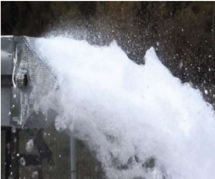
Fig. 1. Fragment of the foam generator of high multiplicity with a spiral nozzle.

Depending on the height of the building, it is advisable to install high multiplicity foam generators every five floors. Some generators will fill the space below the elevator with foam, and other generators will fill the opening above the elevator [11-18].