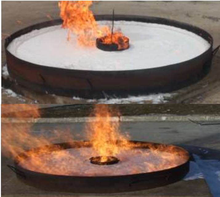
Fig. 3. Foam isolating power being lost.

Foam insulating capacity was determined in a range environment and on laboratory setup. Fragment softesting are shown in Fig. 3.