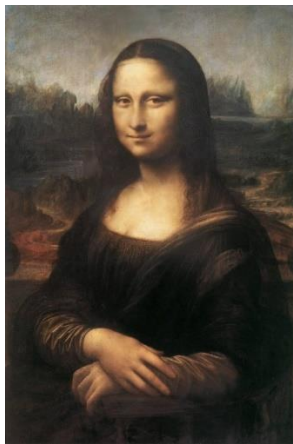
Fig. 3. Sfumato

Tonal and aerial perspective. Sfumato. Aerial perspective is characterized by the disappearance of clarity of the objects' outlines as they recede from the observer's eye. In this case, the background is characterized by decrease in color saturation (color loses its brightness, the contrasts of light and shade are softened), thus, the depth seems darker than the foreground.