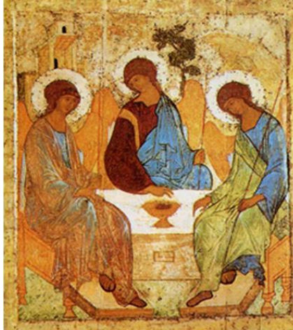
Fig. 2. Reverse perspective

this perspective system was considered the wrong method, and the term of perspective — false. However, academician B. V. Rautenbach, arguing against this misconception about the reverse perspective, shows that in certain conditions (at a small distance) the human eye perceives the image not in a straight line, but in the reverse perspective, which phenomenon, thus, lies in the sphere of perception itself [5].