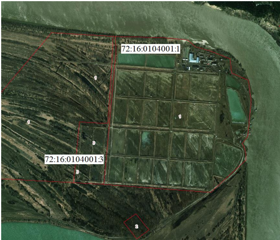
Fig. 2. Conditional plots.

To date, the formation of a unified land use is not provided by the legislation, as a result of which such land plots are unable to be created. However, previously registered land plots with similar status still exist with the appropriate mark and participate in civilian traffic [10].