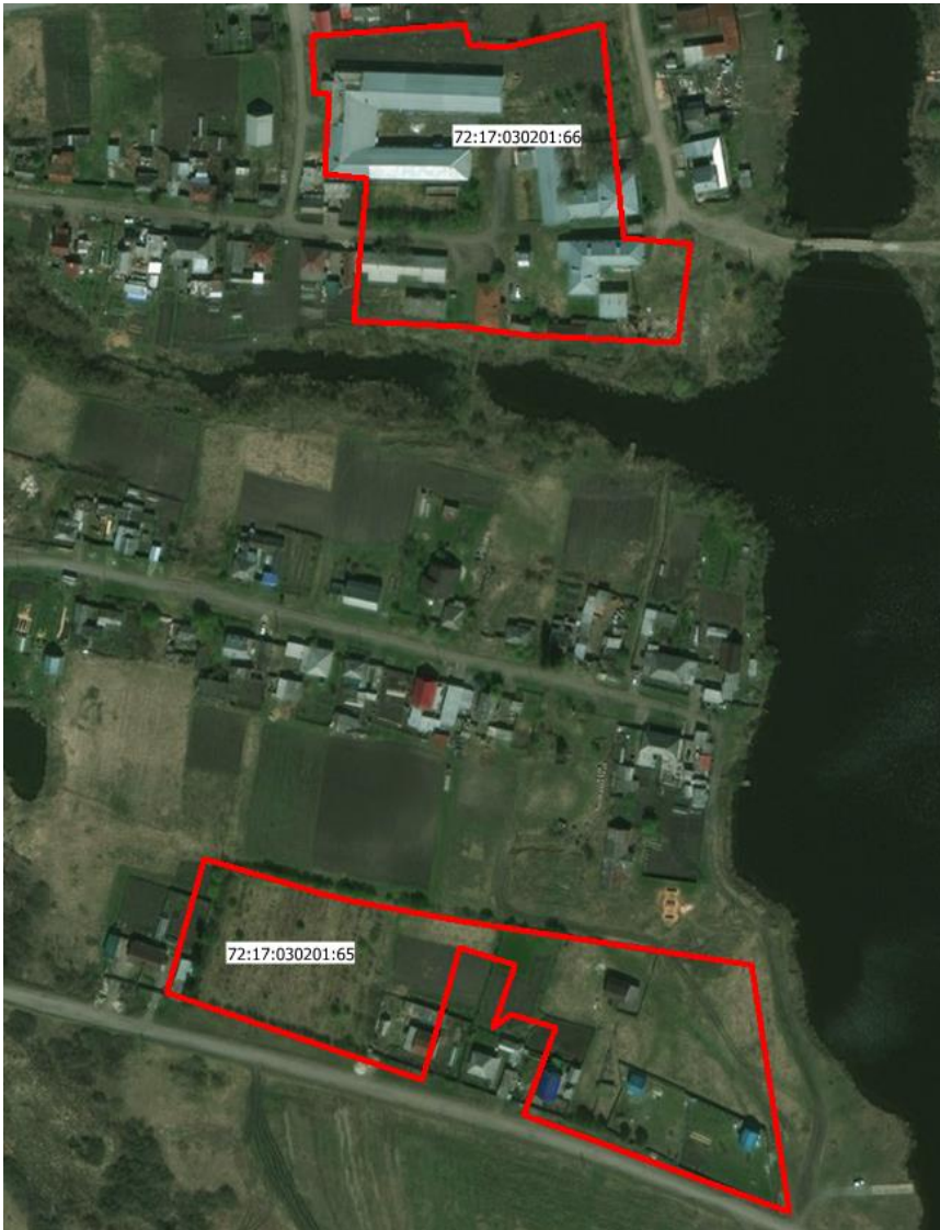
Fig. 1. Isolated plots.

To account for single land use located in several cadastral districts “All-Russian” cadastral district was created with the cadastral number «00», the border of which runs along the state border of the Russian Federation, Cadastral numbers of such single land use begin with the number «00» [15].