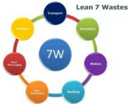
Fig. 1. 7 Wastes, according to Lean Technology [8].

Lean manufacturing consists of different methods, tools and techniques, which are aimed on the loss reduction or elimination during the production process: