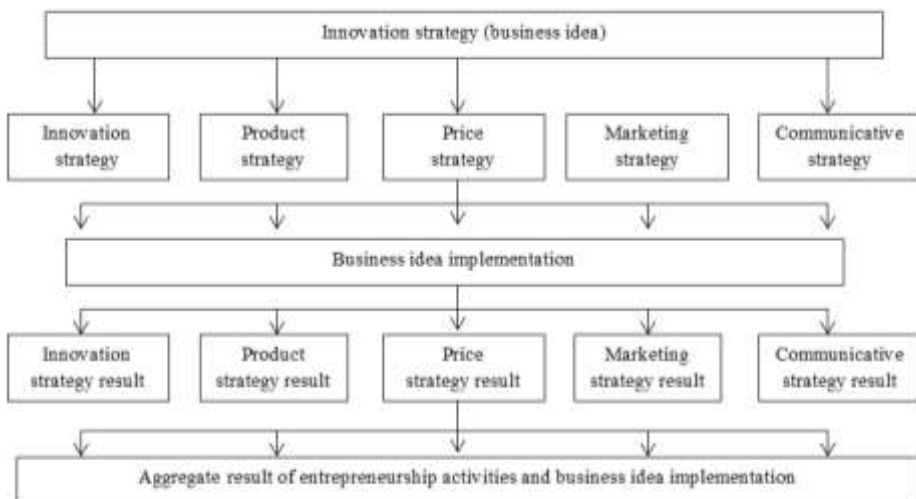
Fig. 1. System of interaction of the goal and the end result of entrepreneurship activities.

The relationship of goals and end results represents the basic principle of assessing the effectiveness of entrepreneurial activity (Fig.1.) [5].