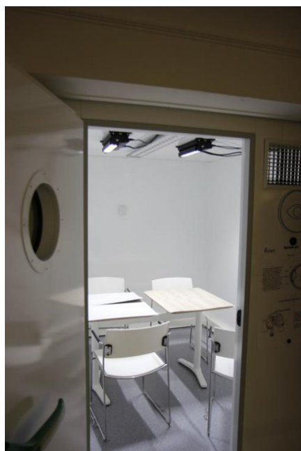
Figure 1. The light test chamber set-up.

each other and next to each other. Two desks on one side were labelled A, and the other two, B.