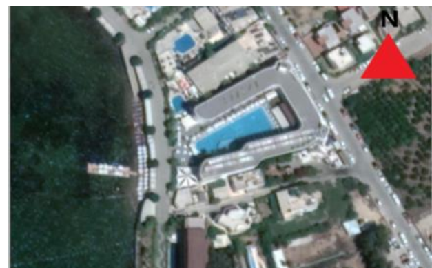
Fig. 2. An image of existing hotel building from the top.

The orientation of the building to the north is shown in Figure 2.