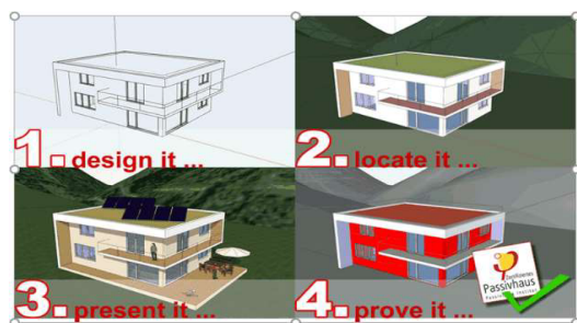
Fig.5. Flow diagram of PHPP certification

The workflow in designPH for the OVER 4 prototype follows these steps: