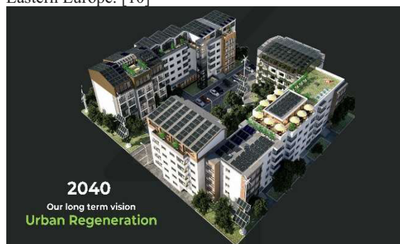
Fig. 1. Graphic realized by Over4. Urban Regeneration 2040

The main goal of the Over4 project is to improve the way in which the collective dwelling blocks built during the communist period are currently being renovated in Romania. Over4 aims to develop and implement an Integrated Rehabilitation pilot project applicable to the G + 4 floors blocks (type 770-83) built during the communist period, which fulfills the objectives and requirements of the European Union regarding the reduction of the energy consumption and the environmental impact for residential buildings. (according to Directive 844/2018). The 770-83 G+4 floors block of flats is the most widespread in Romania (over 4,500 blocks identified in Bucharest in just 9 neighborhoods), and similar models are spread across Eastern Europe. [10]