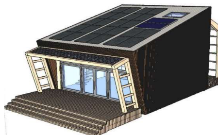
Fig. 6. 3D model of the OVER 4 project analyzed in designPH

To summarize the steps of the analysis Figure 5 is a perfect way to illustrate this aspect. The workflow from PHPP module is also divided in several secondary stages: