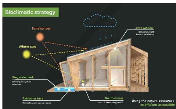
Fig.3. Bioclimatic strategies for the OVER 4 prototype

Other strategies were implemented in the prototype: compact form, orientation, the use of shading systems, passive preheating or passage of fresh air, the use of renewable energy sources, intelligent automation system and finally the use of energy-efficient home appliances.