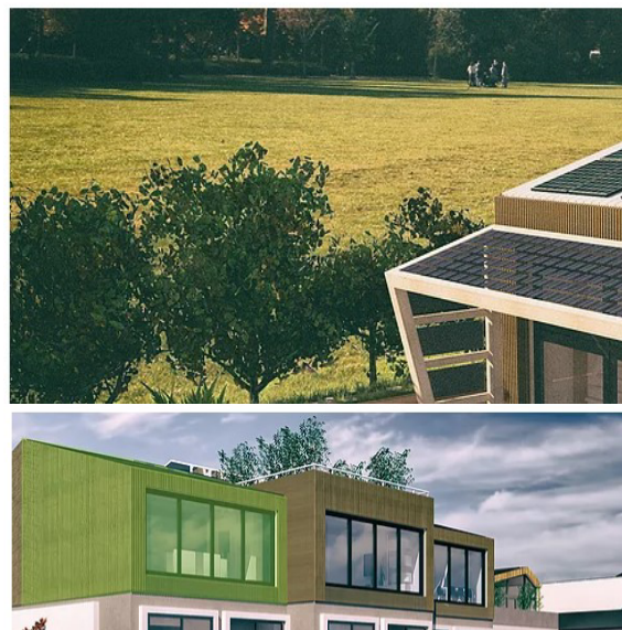
Fig. 2. The OVER 4 modular Prototype and integration on 770 roofs

An additional strip of semitransparent photovoltaics will be placed on top of the south terrace to allow the light to go further inside the house and for the shading system to cover it during summer. [10]