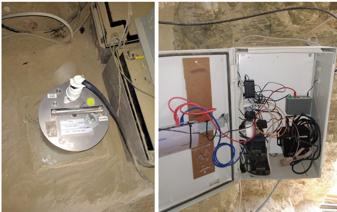
Fig. 2 - Example of a seismic station – On the left there is the sensor and inside the box on the right there are the acquisition systems (Lunitek Atlas) fed by batteries, and the transmission systems (UMTS modem) fed by mains power supply with additional surge protections. The two systems are electrically disconnected through a pair of optic fiber modems

instrumentation is not necessary if all the system (acquisition and transmission) is fed only by Tesla turbines, for a benefit of the system also in terms of streamlining. The complete average power consumption of the tested seismic station (Fig. 2) (sensor “Guralp CMG40” with digitizer “Lunitek Atlas”: average power consumption of 3.1 W) transmitting through an industrial cellular modem (Conell UR5: average of 3.5 W with GPRS transmission) is of about 6.6 W.