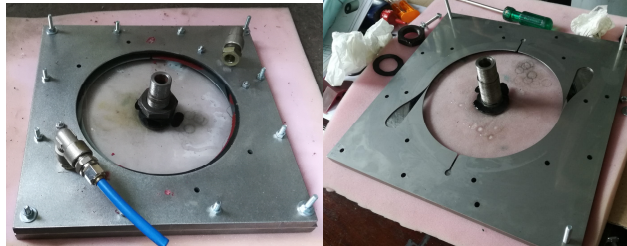
Figure 1 The complete test rig (left) and the rig opened (right)

For the experiments, saturated water (initial quality equal to 0) will be used at the absolute pressure of 4 bar and corresponding temperature of about 140°C. The fluid enters through the two inlet holes (diameter: ½ inch) and a mass flow of 1.3-2 g/s will evolve inside each nozzle and in the gap between the two glasses, then it exits through a hollow shaft placed in the centre of the circular windows (figure 2). Two passages at the periphery are also present to discharge liquid accumulation in the chamber between the windows.