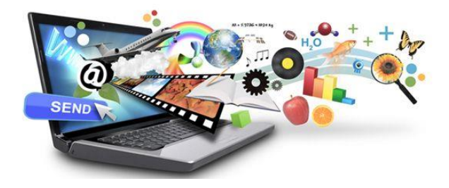
Fig. 2.Computer information acquisition system

Therefore, training to master high-tech innovative talents, to build life-long learning system is the development of higher education in the 21st century. In the information society the use of information technology to improve the efficiency of higher education institutions, to expand the scope of the main contents educated people, explore new teaching model, has become the world of higher education reform and development. Under this environment, art and design education has also ushered in the best opportunities for development. Arts education will focus on information technology and produce new changes, along with the deepening of reform design education, art and design education in the information age will also be full of new vitality.