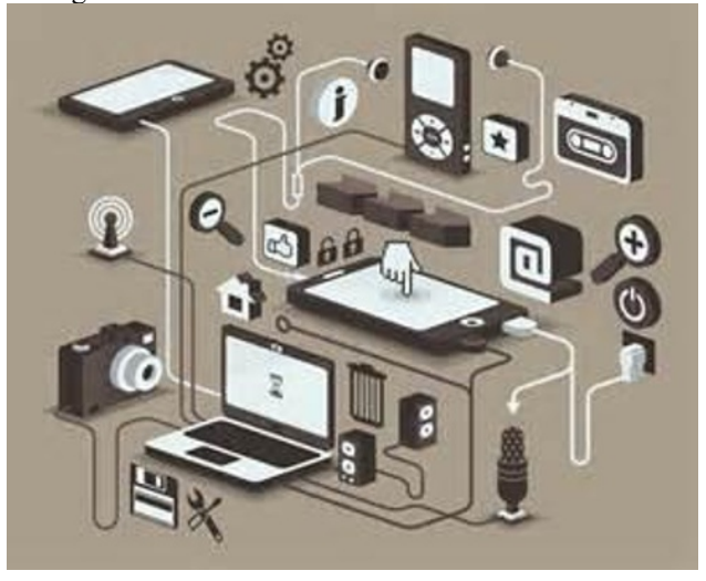
Fig. 3. Computer information Hardware topology system

Information management database is mainly used for student information management, teacher information for authentication management, and user login. When the authentication, the need to provide the identification number and password to the user information management database query the appropriate information in the table, until the match geese before allowing users to log on to the learning platform. System maintenance personnel can add, delete user list. Student information management is to save student information for students to query and modify. For example, students can modify their own personal nickname, password, address, etc. Information management is to provide teachers for teachers query, change of personal information, and to provide access to students' personal information and academic records, etc., to help manage student learning. In addition, the relationships between three databases are interdependent. Learning Resources Database part exercises or as part of a database of exam test questions. The quiz questions in the exams results database will also serve as student and teacher personal information is stored in the correspond ding location information management database.