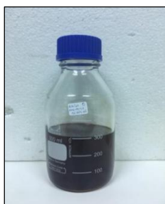
Fig. 8. Liquid from the pyrolysis of mixed polypropylene, polyethylene, polystyrene, and used engine oil.

The products yields are presented in Table 4. The pyrolysis oil obtained from polyethylene, polystyrene and used engine oil were 75.71%, 93.13%, and 65.72% respectively. The result reveals that the different of raw material structure resulted in the pyrolysis product yield [12]. The used engine oil had the lowest pyrolysis oil yield. However, when used engine oil was mixed with polypropylene, polyethylene, and polystyrene plastic waste, the pyrolysis oil yield was increased.