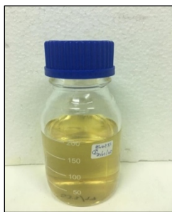
Fig. 3. Liquid from the pyrolysis of polypropylene plastic waste with 5% molybdenum modified alumina-silica catalyst.