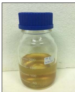
Fig. 2. Liquid from the pyrolysis of polypropylene plastic waste without catalyst.