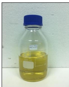
Fig. 5. Liquid from the pyrolysis of polyethylene plastic waste.