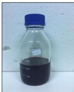
Fig. 7. Liquid from the pyrolysis of used engine oil plastic waste.