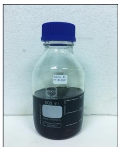
Fig. 6. Liquid from the pyrolysis of polystyrene plastic waste.