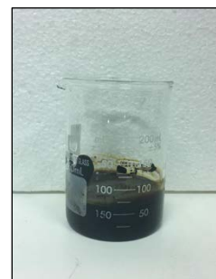
Fig. 1. Solid from the pyrolysis of polypropylene plastic waste without catalyst.

From Table 2, the products from pyrolysis test have 3 states, liquid, solid and gas. The pyrolysis process of polypropylene plastic waste that did not use catalyst and used catalyst at 5% and 10% molybdenum modified alumina-silica catalysts were investigated. The results show percentage of pyrolysis oil were 81.67%, 83.65% and 86.63% respectively. For the solid waste had percentage yield between 1.38 to 6.31% by weight, the system that did not use catalyst had the most solid waste of polypropylene plastic as seen in Figure 1.