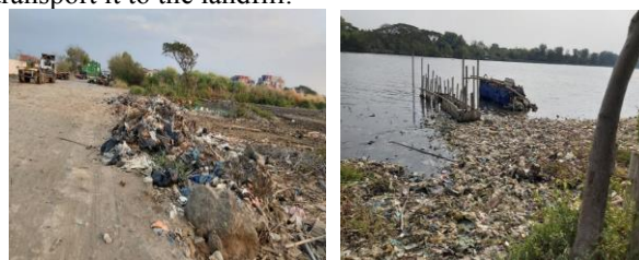
Fig 2. Tidal Flood Waste in North Semarang (Field Observation, 2019)

pattern of waste collection by picking up waste at the site of waste generation and transported to the location of temporary sites; as well as the need for collection facilities ranging from the needs of vehicles and heavy equipment, operational needs of workers, cleaning tools, tools, emergency needs, to first aid kit; and (b) Transporting waste to the location of temporary sites (TS) is useful for moving waste collected from the waste collection location to a temporary collection site, for then moving the waste to a device or vehicle that will transport it to the landfill.