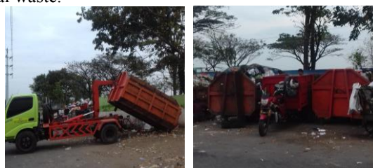
Fig 3. Waste Management Activities in North Semarang (Field Observation, 2019)

This analysis of waste handling activities will be the basis for facilitating the activities of handling tidal floods to clean. Besides that, the activity of tidal flood waste management will help to formulate the needs of tidal flood management facilities.