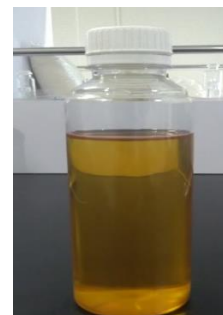
Fig 3. Biodiesel produced

Based on the test results, biodiesel calorie value is higher than the value of the diesel oil which means higher heat energy emitted from combustion. Flashpoint testing showed 15.5 ° C higher than the diesel oil. Utilized the boiler temperature of lighters that reach 3,000 ° C, and biodiesel flashpoint is 75.5 ° C then the burning process become instantly. Viscosity and density affect the ability of fuel spraying into the fog, thus perfect combustion has occurred, the results of density and the viscosity is still within the limits of the specifications have been determined.