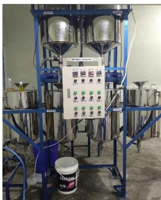
Fig 2. Biodiesel processing machine

FFA levels are less than 2% so that biodiesel production without going through esterification reaction [16]. The level of FFA cooking oil standard distributed according to SNI (Standard National Indonesia) is < 0.3%, even the result after nine times of usage showed FFA results 0.393% [17]