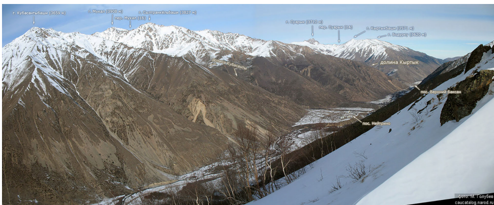
Fig.1. The Baksan gorge as seen from the slope of the Mt. Andyrchi. The gorge bottom, flat and narrow, is clearly seen.

As it was mentioned, the Baksan neutron monitor is at the neutrino observatory in the village of Neutrino in the Northern Caucasus in the Baksan gorge at height of 1700 m above sea level. The coordinates of the NM location are: 43^\circ 16' 22.81'' \text{ N} and 42^\circ 41' 06.04'' \text{ E} . The building, where the NM is installed, is at the foot of the slope of the Mt. Andyrchy, being of more than 3900m high. The southern slope of the gorge is formed by the spurs of the Greater Caucasus Mountain Range of at least 3500 m high. The northern slope of the gorge is a bit lower than the southern slope, with the height of the peaks exceeding 3000 m. In the very vicinity of the settlement of Neutrino there is the peak Moukal of 3800 m high. The gorge's bottom is only of some hundreds of meters wide along its extent, extending from the town of Tyrnyauz to the village of Terskol, being of over 40km long. Thus, the Baksan gorge is very narrow and deep in its upper part. Figure 1 shows the gorge as seen from the slope of the Mt. Andyrchi.