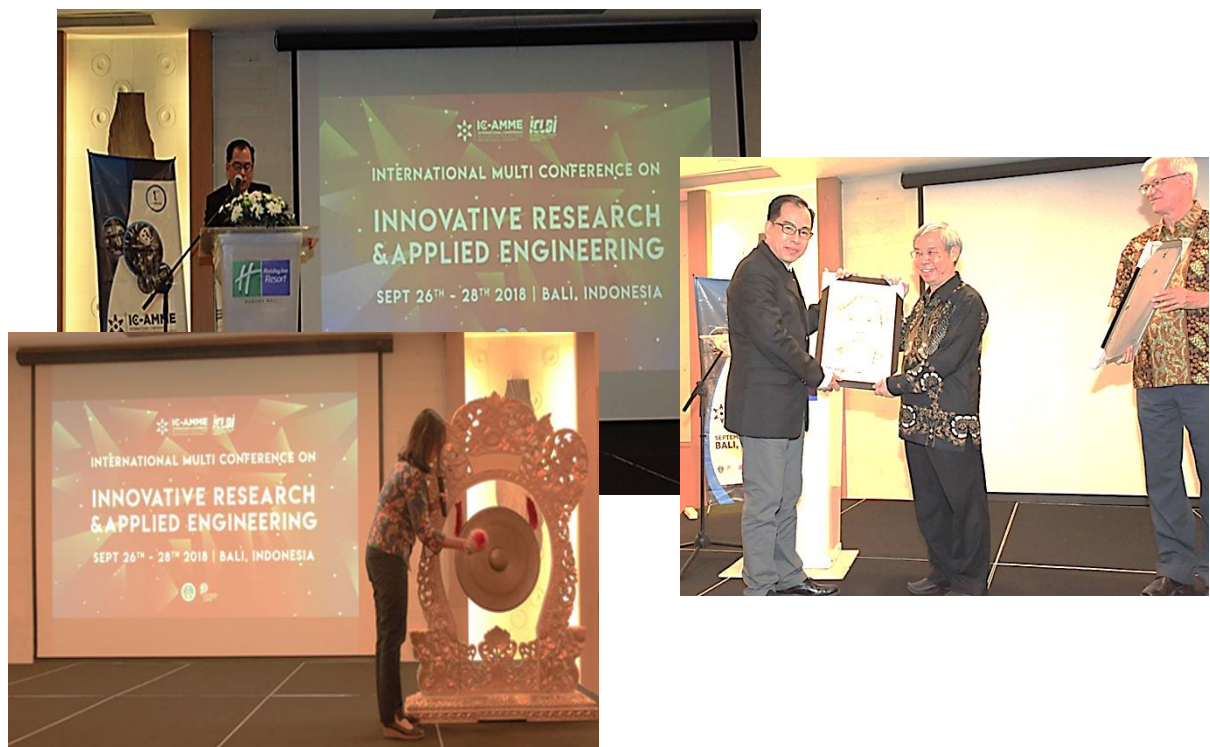
IC-AMME 2018: Opening Ceremony