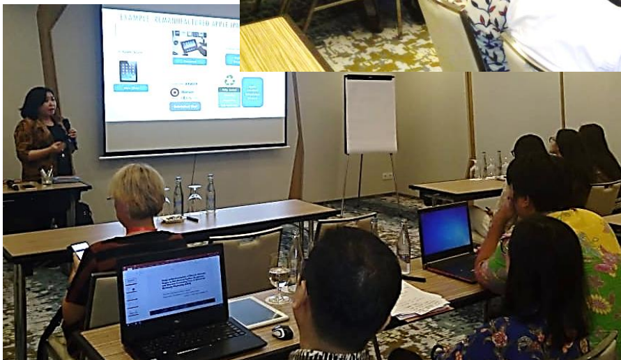
IC- AMME 2018: Parallel Session