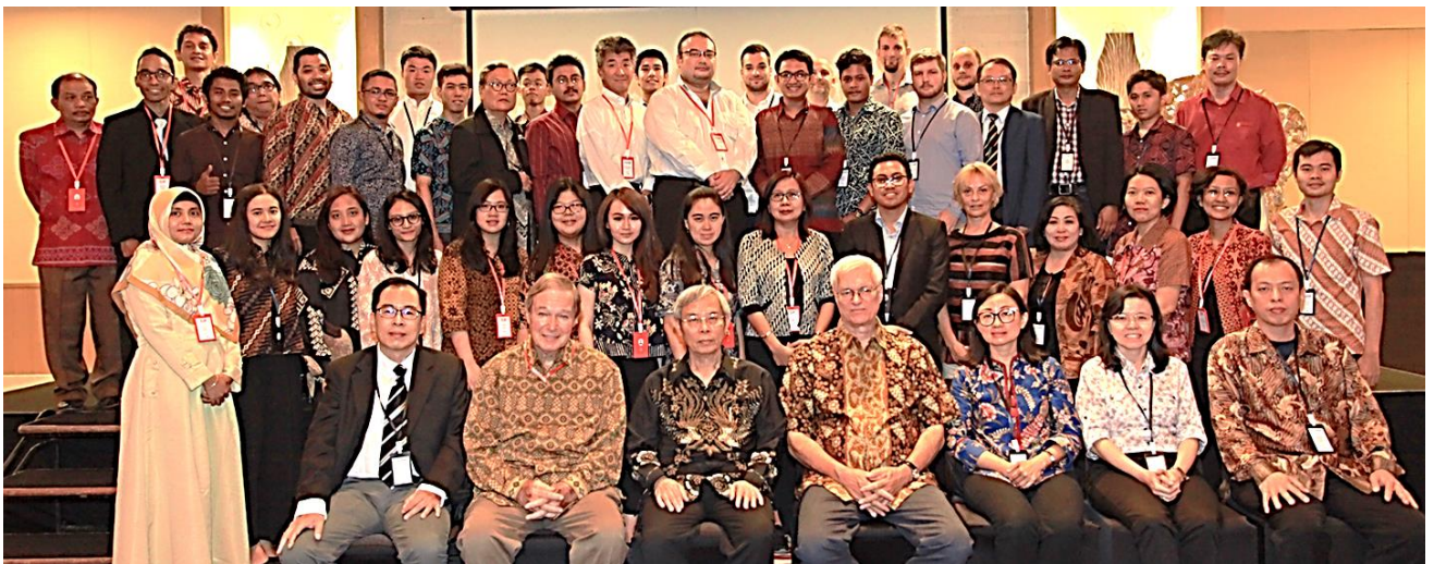
Participants of the 1st International Conference on Automotive, Manufacturing, and Mechanical Engineering (IC-AMME 2018)