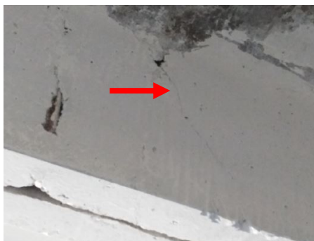
Fig. 2. Crack in the edge of the slab. Opening width up to 0.4 mm.