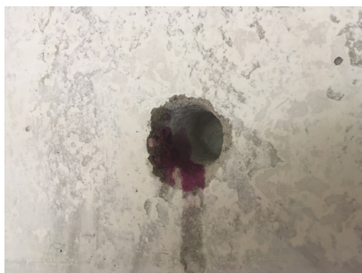
Fig. 4. Color change of phenolphthalein solution due to carbonation of concrete to a depth of 20 mm, according to autopsy No. 4.