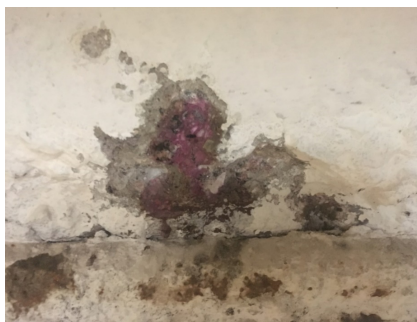
Fig. 6. The depth of carbonization according to the visual data of the phenolphthalein sample exceeds the value of the concrete protective layer by 10 mm, according to the autopsy data No. 7.

On autopsies №2, 3, 6, 10 there are no changes in the color of the phenolphthalein sample.