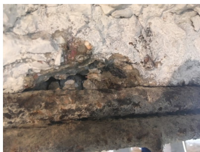
Fig. 5. The absence of visible signs of concrete carbonation according to the results of phenolphthalein samples in the areas behind the working reinforcement according to autopsy No. 2. No concrete protective layer is present.