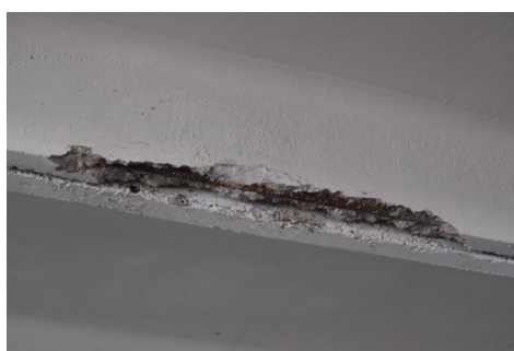
Fig. 3. Bare reinforcement and its surface corrosion with the destruction of the protective layer of concrete.

The detected defects and damages indicate a decrease in the hydrogen pH of concrete to values of 8 \div 10 , which leads to the loss of the passivating effect of concrete in relation to steel reinforcement.