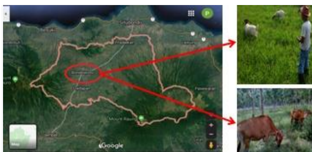
Figure 1. The study area in Bondowoso East Java Province, Indonesia

The study was conducted at field farming with large area ± 1.2 ha, consists of 6 cows, and 10 goats in Bondowoso East Java Province, Indonesia. The topography of the Bondowoso from an altitude 113°48'10" - 113°48'26" BT dan 7°50'10" - 7°56'41" LS.