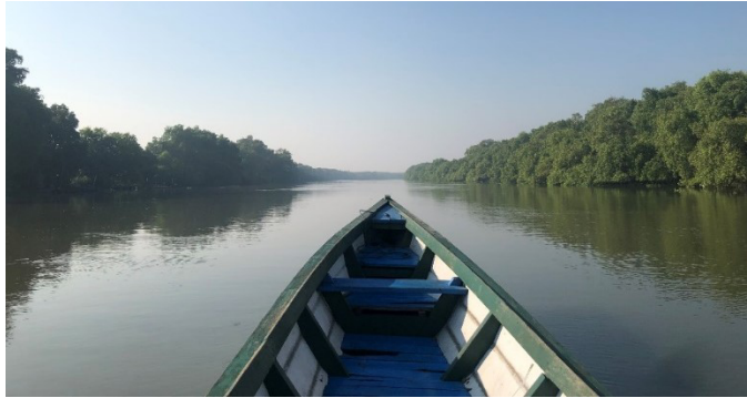
Fig. 6. Boating on Kepetingan estuary as one of the ecotourism product