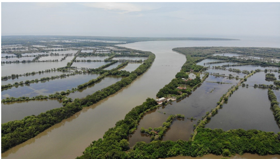
Fig. 1. Aerial photography of Kepetingan River estuary. Most of mangrove areas were converted to the traditional shrimp farms

Aim of this research is to analyse the condition in a remote Kepetingan Hamlet in facing climate change challenges, as well as to determine the suitable solutions regarding those condition from socio-economic resilience approaches. Primary environmental data were collected from Kepetingan Hamlet, Kepetingan River and Permisan Bay. Descriptive analysis is presented as preliminary look at the coastal climate adaptation and resilience in Kepetingan.