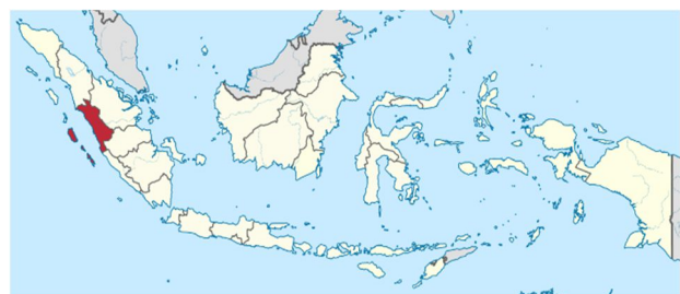
Fig. 1. Location of West Sumatra (red) in Indonesia [9].

In the run theory, the drought in a watershed is when a minimum streamflow in a certain month being smaller than the average of minimum streamflows of the corresponding month for the certain period. In the present study, we determine the river drought-indices in West Sumatra Province (Fig. 1) using the theory of runs. We successfully collect series of the daily average-streamflows for 19 watersheds with a minimum length of 20 years. The resulting indices are then mapped using the geographical information system ArcGIS.