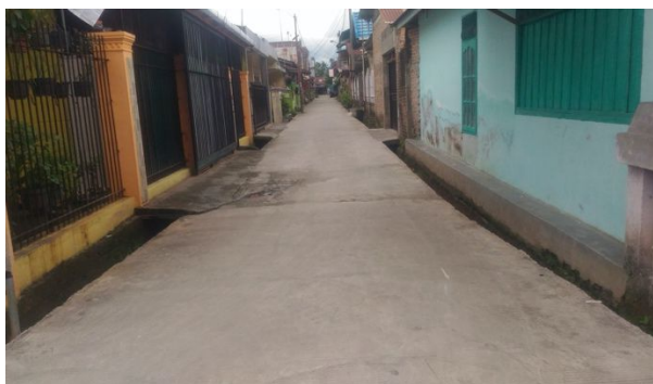
Fig.3. Manggis Street at Belimbing, Kuranji

Typical feature of the local road after concretisation program is in fig 3.