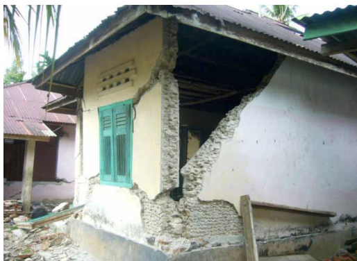
Fig 7. Wall separation of URM