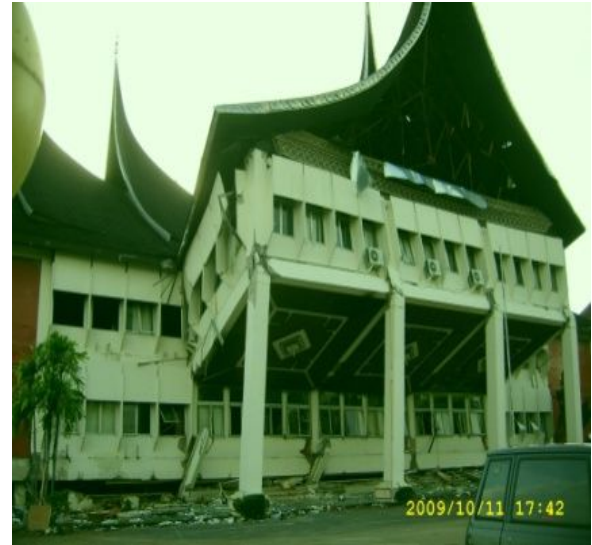
Fig 3. Soft-story effect on buildings