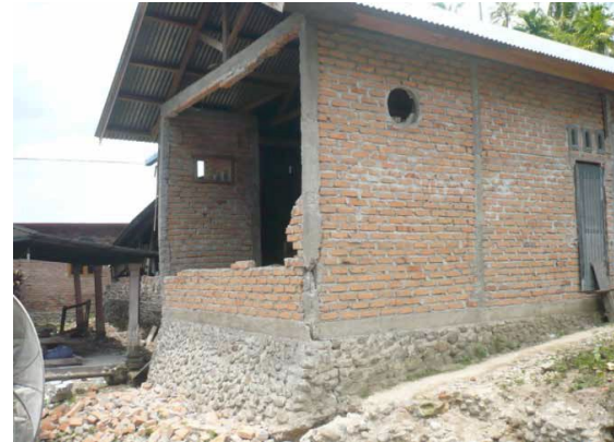
Fig 8. Some brick walls are collapsed

In general, the main cause of damage that occurred, especially in the engineered building due to the West Sumatera 2009 earthquake could be concluded as follows: