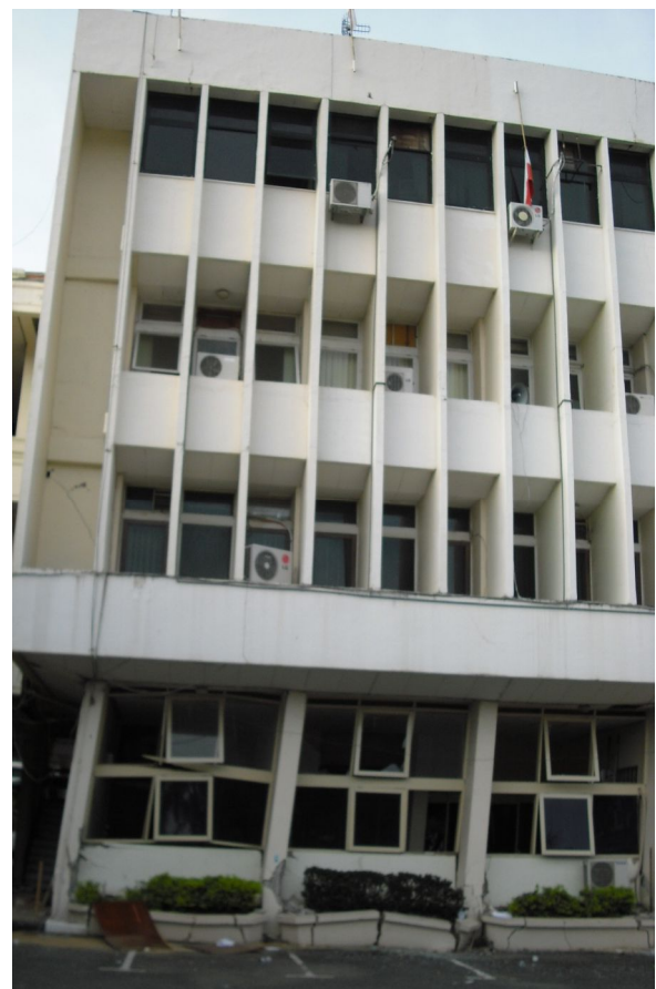
Fig 4. Foundation failure due to liquefaction effect.