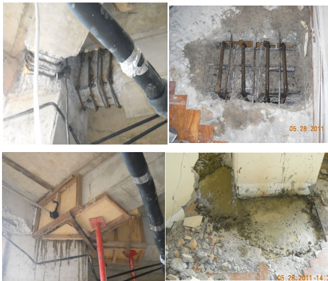
Fig. 11. Repair and retrofitting process of damaged beams

Fig. 3 shows a repair process of the damaged beam as follows. Repair and retrofitting were done by adding a shear reinforcement on the beam, and done the concrete grouting.