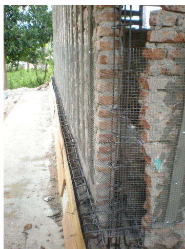
Fig. 12. Repair and retrofitting of non-engineered building by adding the reinforcement of tie beams, columns and link-beam

Non-engineered building repairs and retrofitting were shown in Fig 9 below. The building without reinforcement (Unreinforced Masonry, URM) was added with the reinforcement of the tie beams, columns and link beams. The brick wall were retrofitted with the wire mesh.