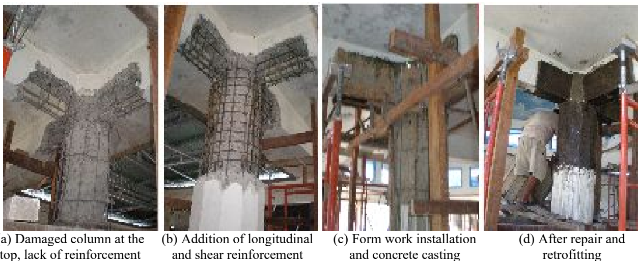
Fig. 10. Repair and retrofitting process of damaged column at the top.