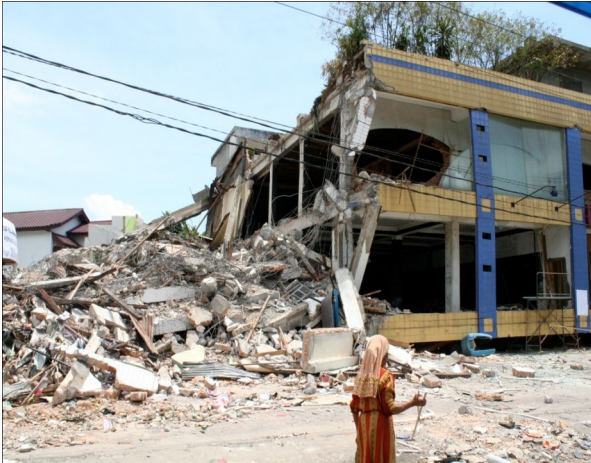
Fig 5. Building collapsed due to material quality do not meet the standards