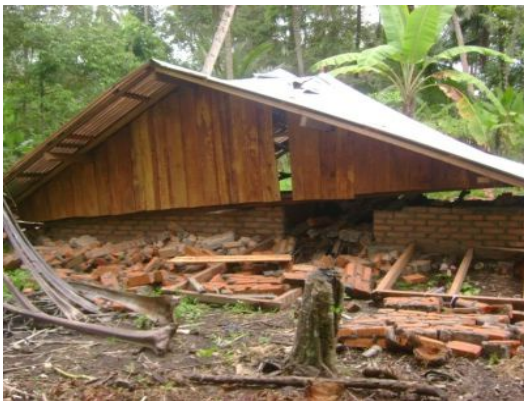
Fig 6. Brick walls collapsed

Fig 6, 7 and 8 show some types of collapse that occur in non-engineered buildings.