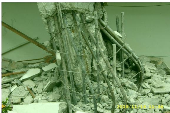
Fig 2. Reinforcement detailing do not meet a standards