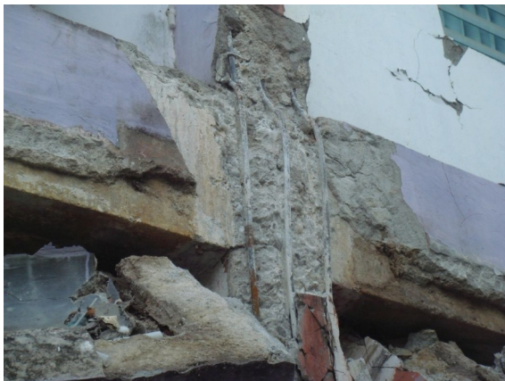
Fig. 1. Bad reinforcement detailing of beam-column joint