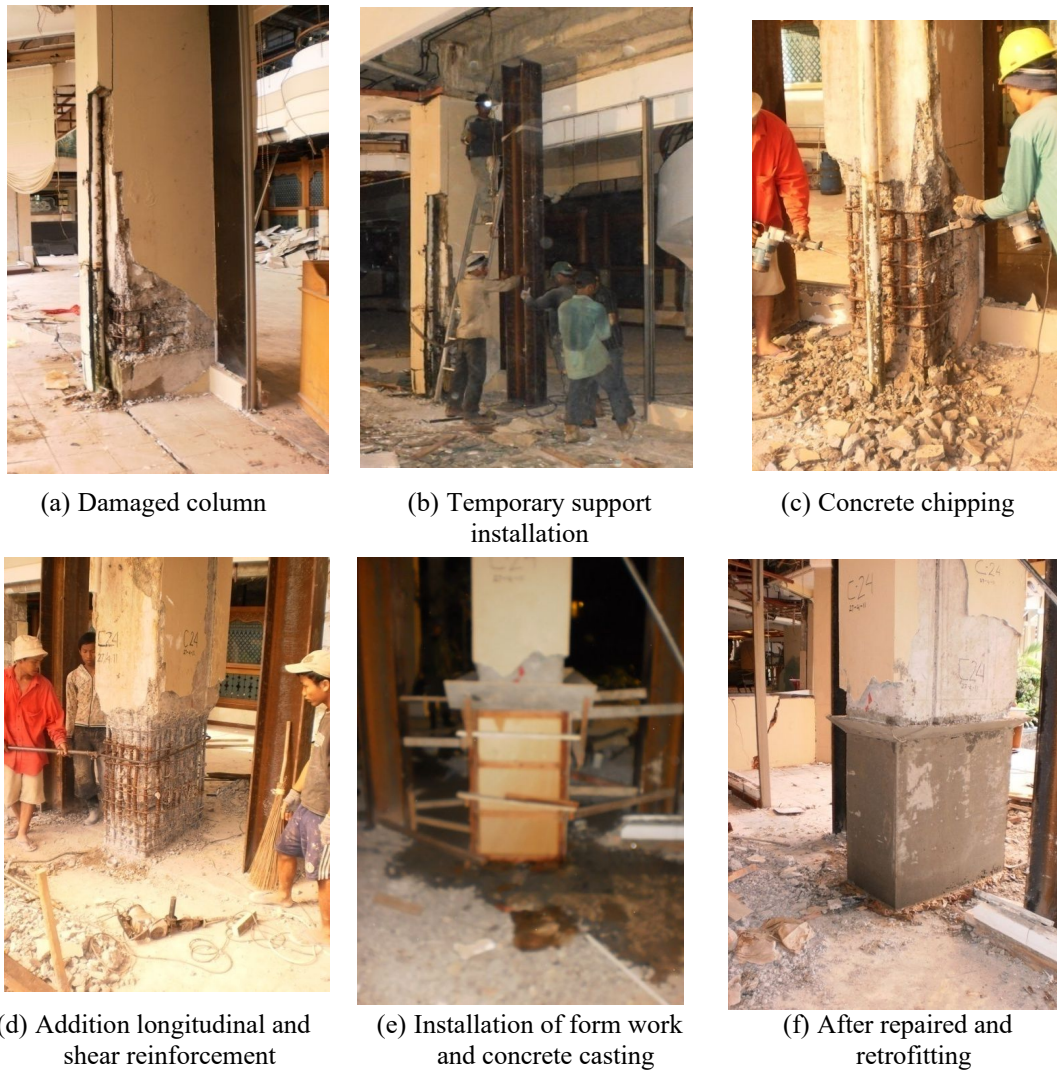
Fig. 9. Repair and retrofitting process of damaged column at the bottom.

shear reinforcement (1.d). Then installation of form work and concrete casting (1. e), and the final result on (1. f)