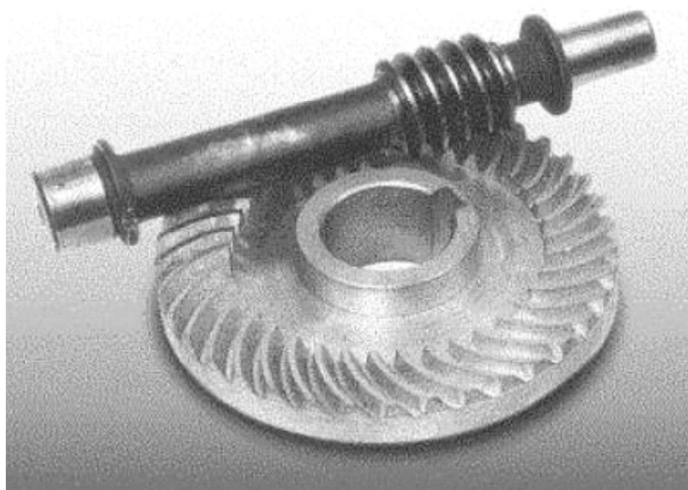
Fig.1. The spired gear.

Spiroids belonging to worm-gear type (see figure 1 [3, 4, 5]), have been applied in various fields of technology for the last fifty years in parallel with worm-gear drives. They became widespread in drives of handling machinery, equipment and machines operating both at constant and variable loading modes.