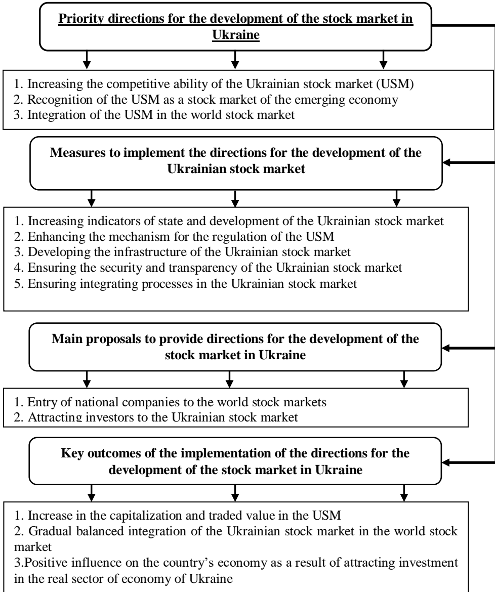
Fig.2. Scheme of the priority directions for the development of the Ukrainian stock market in the context of stabilization of the economy.

non-profit organizations that operate through contributions and donations and serve households; the external world (world economy). According to this scheme, the mediation of the stock market facilitates the accumulation, distribution and redistribution of financial resources, capital in the country's economy.