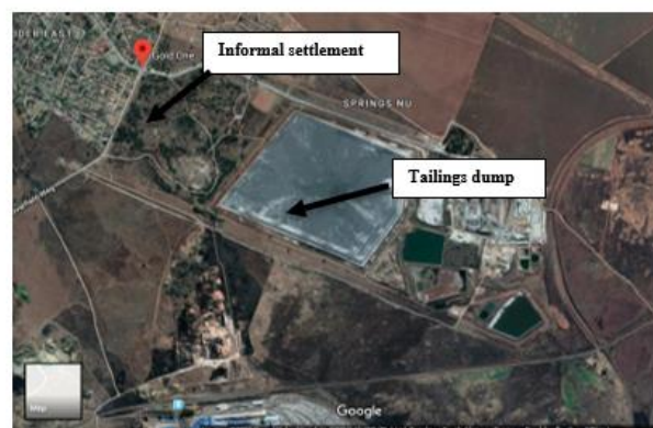
Fig. 1. Location of sampling site

The gold mine dump is in Blesbokspruit in Ekurhuleni metropolitan city of South Africa which lies on the southernmost part of the African continent, and characterized with varied topography, great natural beauty, and cultural diversity. The area is home to mild summers with temperatures seldom above 30° C. During spring and winter, northerly and north-westerly winds occur and during summer north-easterly to north-north-easterly winds occur [18]. There are several seasonal pans across the area covering an area of about 3,559 hectares with a few lakes created by mines, which are used for recreational parks. Figure 1 detailed the location of the tailings dump while the specific description indicating coordinates of the sampling site within the dump are illustrated in Table 1.