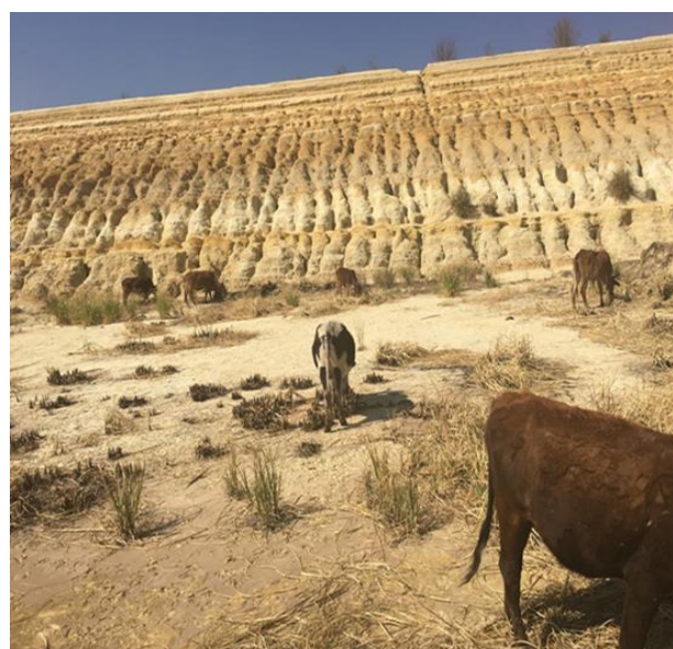
Fig. 2. Grass specie ( Hyparrhenia hirta ) at the gold mine dump.

Hyparrhenia hirta was the only specie of grass found growing around the site Figure 2. The concentrations of heavy metals in the leaves of plants sampled in this study are presented in Table 4. The results indicate that the mean accumulated heavy metals were found to be 46.10 mg/kg for Cu; 40.08mg/kg for Zn; 859.12 mg/kg for Pb; 618.26 mg/kg for Cr; 151.70 mg/kg for Co and 2308.41 mg/kg for Ni. Zinc is one of the most essential elements for plants but when compared with the concentrations of uncontaminated soil is low. This trend could be associated with the readiness with which it can be precipitated as the insoluble sulphate in the rhizosphere, thus preventing potential uptake and transport to the aerial parts of plants [29]. The ability of Hyparrhenia hirta to survive in such acidic conditions and absorb these heavy metals validate their usage for revegetation and stabilization of the tailings dump against wind and water erosion which supports the findings in previous studies [1].