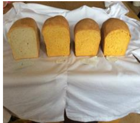
Fig. 2. Samples of bread with the Introduction of PBIF1 from left to right, in quantity 0; 5; 10 and 15% by section.