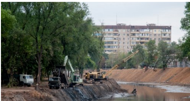
Fig. 3. Works for purification of the Saksahan River [10].

Among other works, significant of works were planned to clean up the Inhulets River in different parts of the Kryvyi Rih city. A project was planned to clear up 4,3 km of the riverbed and 0,5 km an old tributary of the Inhulets – the Saksahan River. Elements for a revitalization of the Inhulets River section and it tributary of Saksahan River, in the central part of the city in the park area, were implemented. The works included the riverbed purification, clearing the banks, arranging the territory (figures 3, 4). Sediment, removed from the river, was mainly deposited at landfills. The works which carried out in the city centre contained elements of revitalization, but the main goal was not done – to restore the flow of the river. The cleared areas are little flowing part of the riverbed.