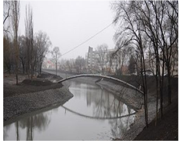
Fig. 4. The intermediate stage of revitalisation project on the Saksahan River [10].

and burying it in ditches, which were located on the low bank of the river at a distance of 10-20 m from the river bank (figures 5, 6). The issues of storage and/or burial of the raised sediment are relevant and important, because it contains significant concentration of heavy metals, radionuclides and other pollutants.