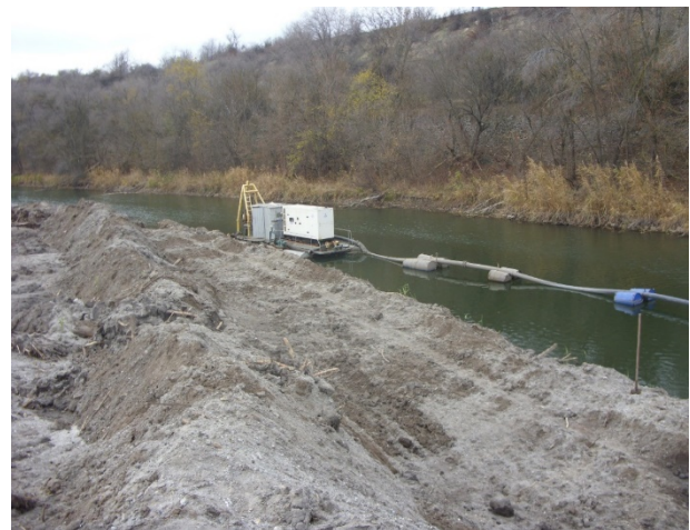
Fig. 5. Inhulets River. Stage of bottom purification.

As you can see from the photo (figure 6), the ditches bottoms did not have any waterproofing, so in a short time a variety of pollutants (including heavy metals) can return end up in the river again. Also, there is a constant washing away of the upper soil layer, because after the backfilling of the ditches, phyto-recultivation works were not implemented.