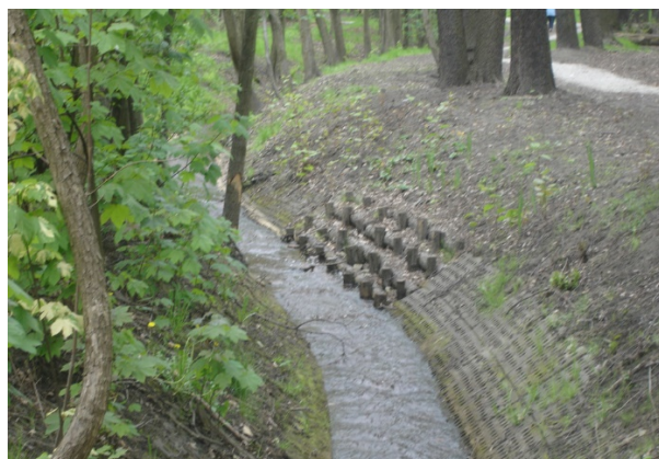
Fig. 2. Slepjotka River after transformation [8].

revitalisation effects, development of habitat diversity and land use transformation were fulfilled. Moreover, the river corridor concept developed and tested in the pilot action area proved to be suitable for implementation along other parts of Slepjotka River and even at sites along other rivers.