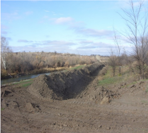
Fig. 6. Inhulets River. Ditch along the river which intended for burial of sediments.

The main tasks of the revitalisation in European countries, and in Poland in particular, are questions of flow restoration, improved hydrodynamics, self-purification and ecosystems restoration. In the same time, the main goal of the revitalisation in Ukraine are still the issues of purification the riverbed from silt or questions relevant to preventing flooding. And on large rivers, the main problem of cleaning operations is the restoration of navigation. In rare cases, the purpose of revitalisation is to increase the recreational attractiveness of the territory (most often we are talking about the central areas of cities).