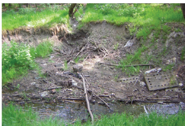
Fig. 1. Slepjotka River before transformation [8].

The main goal of the revitalization action in Katowice was to recreate a blue-green river valley corridor in the highly urbanized, mid-part of Slepjotka River [8]. This particular stretch of the river was chosen for special, ecological and social reasons. The local catchment features numerous forms of land use and an advantageous land-owners structure, since most of the riparian area was municipal property. This river has quite suffered from the discharge of untreated sanitary sewage, but the flood risk was insignificant (figure 1). Additionally, it was located in the neighbourhood of a large housing estate in the direct Ochojec in the centre of Katowice. Access to the river and recreational facilities would improve the living conditions for thousands of inhabitants in the adjacent area. Thus, public support for the idea of revitalisation was high.