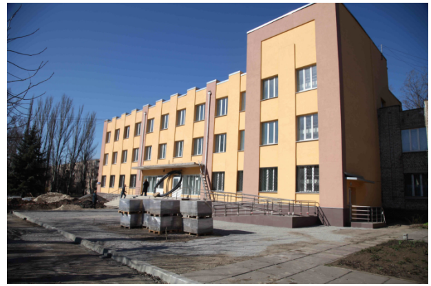
Fig. 5. Children's Hospital No.2, Kryvyi Rih.