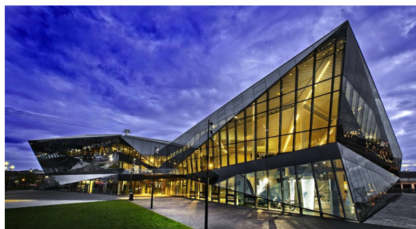
Fig. 1. The Crystal, Wilkinson Eyre Architects, London.

prolonged economic and energy crisis in our country, as well as the fact that most of the architectural and urban system of medical establishments in Ukraine was built in a typical industrial way in Soviet times and today in all respects contradicts energy-efficient requirements as domestic and the world (Fig. 3, Fig. 4, Fig. 5) [4-7]. Build on the ongoing reform of the Ukrainian medical system, the issue of finding and using sustainable architectural solutions in the reconstruction and new development of medical facilities of any scale is becoming increasingly relevant. Therefore, an understanding of the harmony of the environment and the modern architecture of healthcare facilities should be reflected in the emergence of health care projects that integrate best practices in energy-efficient construction, opening a new page in the evolution of architectural design in health care facilities and in the overall history of world design and construction.