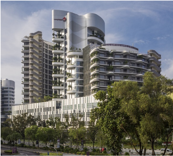
Fig. 8. Fan-shaped outlines in the formation of floorboards and plans of the hospital complex Ng Teng Fong (NTFGH) & Jurong (JCH).

percentage of mechanical ventilation coming from ceiling and exhaust fans. During the fog season in Singapore, the windows of hospitals are closed and both buildings use a centralized air filtration system. The integration of the naturally ventilated design of the hospital complex has reduced mechanical cooling by 70 percent, as well as installed smaller cooling towers that use filtered wastewater and selected water from the air-conditioning system, allowing for more cycles of water reuse.