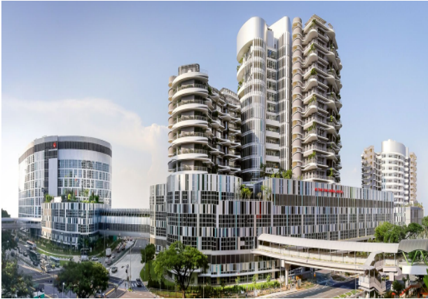
Fig. 6. General view of the hospital complex Ng Teng Fong (NTFGH) & Jurong (JCH).

to the design and operation experience of architectural-environmental complex of Ng Teng Fong Innovative Singapore Hospital (NTFGH) and Jurong Public Hospital (JCH), which have received numerous awards in energy competitions, ratings and certifications and energy efficiency and certification designing health facilities worldwide (Fig. 6).