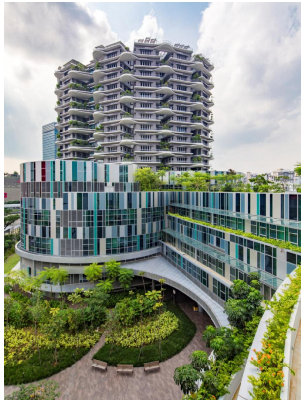
Fig. 14. Active use of landscaping in hospitals Ng Teng Fong (NTFGH) & Jurong (JCH).