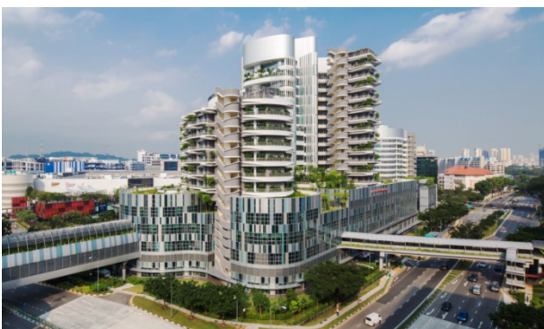
Fig. 7. Accommodation of the hospital complex Ng Teng Fong (NTFGH) & Jurong (JCH) in the urban area.

Both hospitals, with a total capacity of 1,100 wards, are the first in the country to be built under the new mandate of the Ministry of Health of Singapore (part of the Progressive Health Master Plan 2020), aimed at providing the state with patient-centred services in a comprehensive mode, that is, by combining emergency services and outpatient specialities with a general public hospital. In this sense, the complex of NTFGH and JCH hospitals, functionally and planning integrated within one territorial area, serves as a good model for both Ukrainian architects and health care organizers in the context of the global trend of combination and concentration in one building spectrum of medical services (primary, secondary and tertiary levels of medical care) (Fig. 7) [19-22].