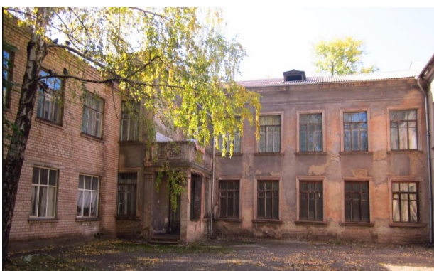
Fig. 4. Hospital building No.3, Kryvyi Rih.