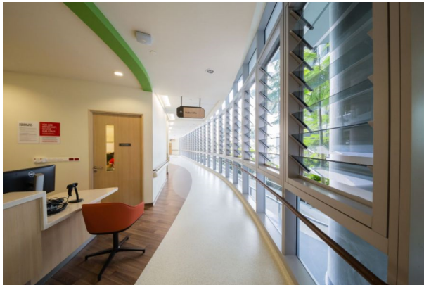
Fig. 12. Sun blinds in hospitals interior Ng Teng Fong (NTFGH) & Jurong (JCH).