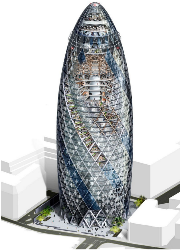
Fig. 2. 30 St Mary Axe / Look Inside, Foster + Partners.