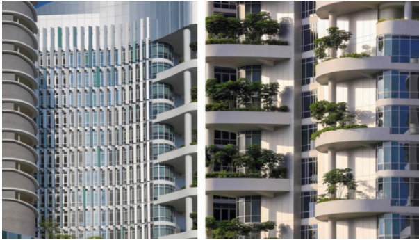
Fig. 11. Use of sunshade in a hospital complex Ng Teng Fong (NTFGH) & Jurong (JCH).

inside the buildings, absorption and filtration of pollutants (Fig. 13, Fig. 14, Fig. 15, Fig. 16). Other sustainable environmental strategies used in NTFGH and JCH include water-saving plumbing equipment and rainwater accumulation systems that help to irrigate a large area of landscaping.