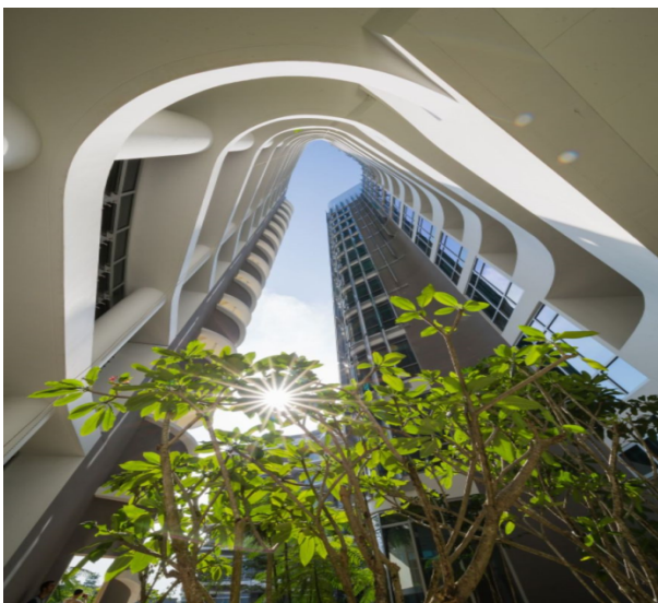
Fig. 13. Exterior view of hospital complex Ng Teng Fong (NTFGH) & Jurong (JCH).