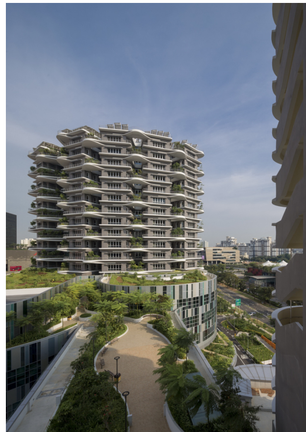
Fig. 15. Hospital in an urban environment.