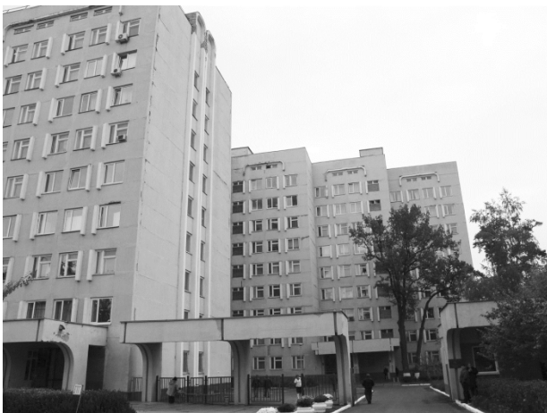
Fig. 3. Kyiv City Clinical Oncological Centre.