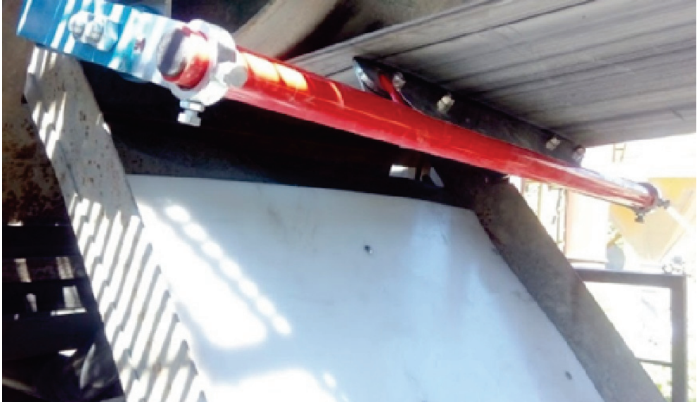
Fig. 5. Wiping technique.

polyurethanes. Example No.6: combination of rubber and polyurethane lining, Figure No. 7: rubberizing the internal parts of the filter station [4].