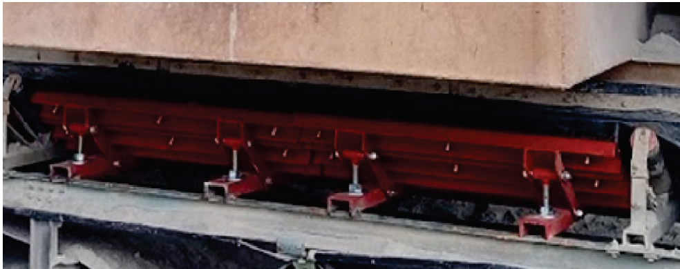
Fig. 4. DPL800/7.

Moving parts of the conveyor line (belt conveyors): in terms of mass transfer by means of a belt conveyor, we will mainly deal with the service life of the conveyor belt, which is most susceptible to damage-choice of quality wiping technology. Rubber for lateral guidance, regular inspection of conveyor rollers, use of impact areas in places of off-impact of transported material example no. 4 impact area no. 5 wiping technique + slip lining PE 1000/10.