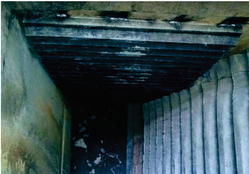
Fig. 1. Tooth plate VSS60-80 mm.

We cannot do this without quality hard rock shop windows with a thickness of about 20 mm supplemented with tooth plates type VSS60-80 mm. See Fig. 1 by combining these materials, we can maximize the service life of the transport route.