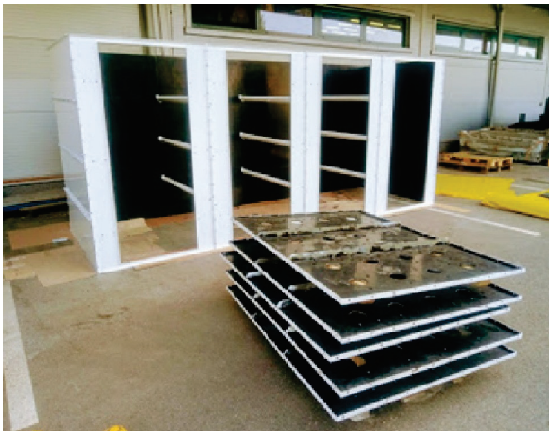
Fig. 7. Rubberizing of filters.