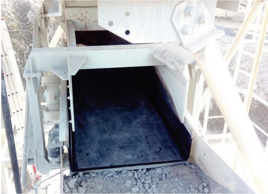
Fig. 3. Rubber lining gLB 60/CN 10mm (Source: WP systems s.r.o.).

Stationary active parts of the transport route (vibratory feeders, belt feeders): usable hardox lining or rubber anti-abrasive lining, depending on the specific operating conditions. Example No. 3: rubber anti-abrasive lining of vibrating feeders. [3]