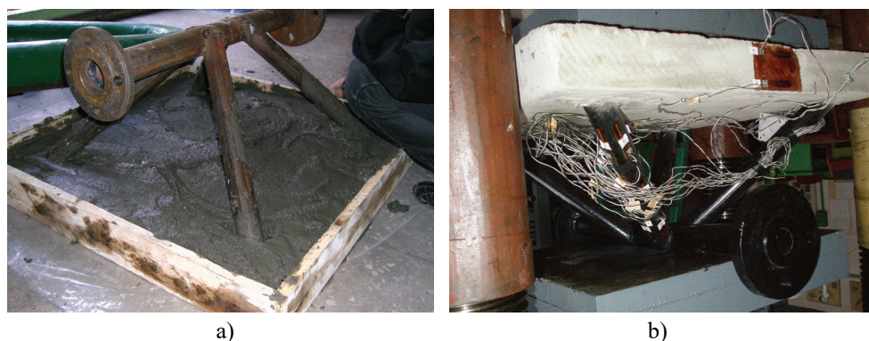
Fig. 4. It is the combined structural elements while production (a) and testing under uniform load (b).