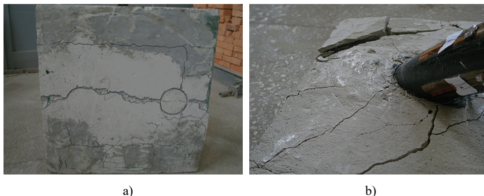
Fig. 6. Destruction of test specimens are caused by the concentrated forces (a) and uniform load (b).

So, for example, under the concentrated forces, the carrying purpose is performed by the slab, which is supported by four points. But, it should be noted that the slab of the module, which is in the support has limited displacements and strains by the nearby modules. Accordingly, the slab behavior is the same as an edge supported slab, but it does not change the design diagram because imposed loads cause the bending moments in two axes that are mutually perpendicular. Since the permanence of the combined action between the modules is not guaranteed and the connection can be broke that's why it is recommended to consider the slab as a slab supported on four points because it is the worst boundary conditions. But in the module that is under uniform load, the most stressed elements are the steel tube web members that are stressed by inner forces that are passed by the slab thought the connection. That inner forces distribution is caused by that the load, which is imposed by the press through the big rigid steel disc not cause strains of the middle part of the slab more than the strains of the edges.