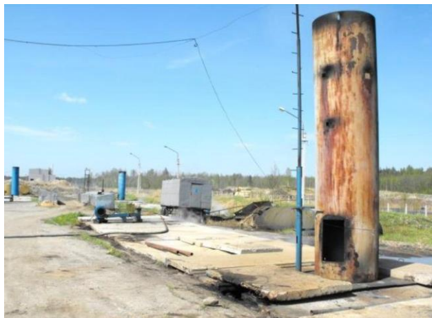
Fig. 3. Waste-to-energy installation at “Krasny Bor” landfill site, 2010.

Totally, around 2 mn t of industrial waste of different class of danger has been brought all together to the landfill site of 70 pits, including 700 thsd t of liquid and pastelike toxic waste with extremely unpredictable chemical “behavior”, 3 mn t of contaminated soil (Table 1).