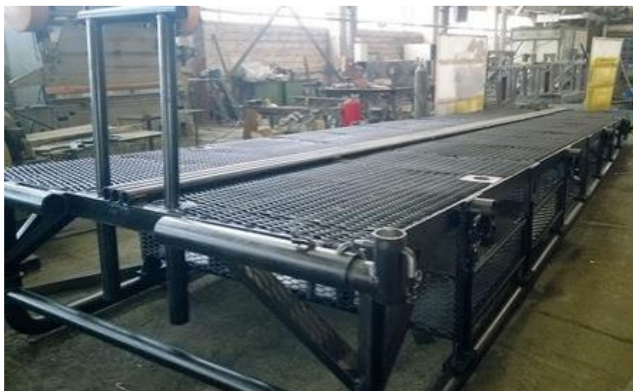
Fig.2. Mechanized V-door ramps.

In order to provide well construction technology with the horizontal pipe laying, the mechanized V-door ramp (MVDR) (Figure 2) of the drilling rigs has two racks (on the right and on the left). The drill pipes are stored on one rack, the casing pipes are stored on another rack.