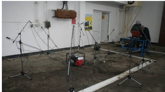
Fig. 4. Microphone distribution for determining the acoustic power of the PULSE system (9 microphones).

Sound power level was determined using the PULSE system, equipped with 9 microphones and distributed according to the instructions from SR EN ISO 3744/2011.