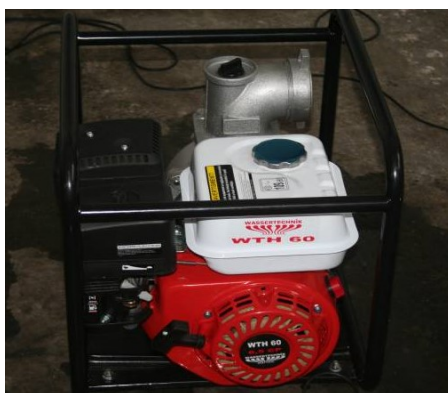
Fig. 1. Centrifugal pump equipped with an internal combustion engine WHT 60.

Centrifugal pump WHT 60 is composed out of a petrol engine and a water pump – the pump is fixed on a frame with a shock absorbent device. The pump itself is composed out of pump body, pump lid, flow paths and the rotor. Pump aspiration is realized with a one-sided valve which does not allow liquid to penetrate the body of the pump.