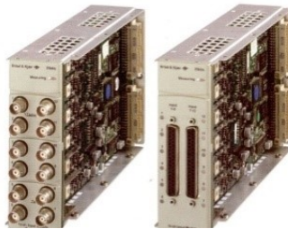
Fig. 2 PULSE Data acquisition board – 12 channels.