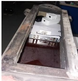
Fig. 7. The platform with signal converter

The robot is provided with indication for depth, electronic compass, temperature and inclination angle. The video signal is transmitted using an analog-to-digital signal converter, and accessed over a network over power network over IP (Fig. 6). This system is located inside the robot housing on a platform (Fig. 7).