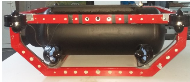
Fig. 3. The underwater robot

Component number 3, the underwater robot , hosts all motion control and navigation systems (Fig. 3).