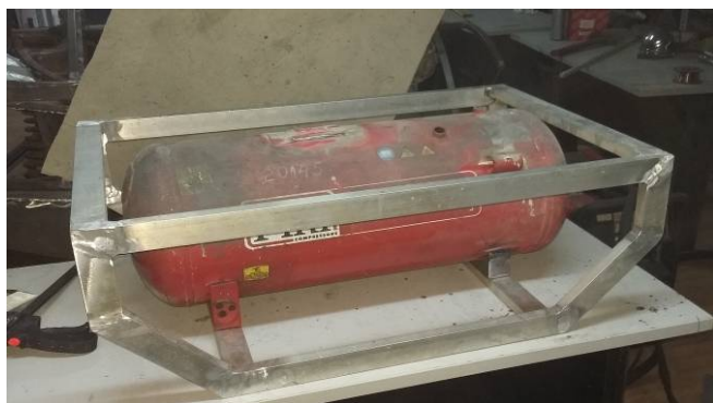
Fig. 1. The structure of the robot body

The remote controlled underwater robot system is composed of three components: 1) the surface control interface; 2) the intermediate device; 3) the robot itself. The structure of the robot body is presented in the Fig. 1.