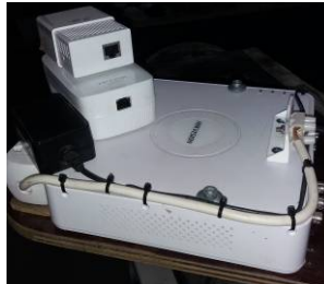
Fig. 6. The analog-to-digital signal converter

The robot is provided with indication for depth, electronic compass, temperature and inclination angle. The video signal is transmitted using an analog-to-digital signal converter, and accessed over a network over power network over IP (Fig. 6). This system is located inside the robot housing on a platform (Fig. 7).