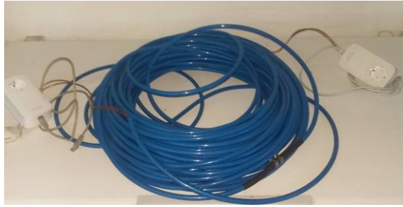
Fig. 2. The control umbilical cord

The surveillance function is performed from the intermediary with the help of a video camera. The video camera is the IP type and can be accessed through the data over power network.