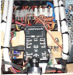
Fig. 5. The multi-device pixhawk pilot system

The auxiliary systems are the following: the data over network system, the communication system formed by a computer from the raspberry pi series, and the multi-device "pixhawk" pilot system. The on-board computer communicates with the "pixhawk" and sends the surface controls to it (Fig. 5).