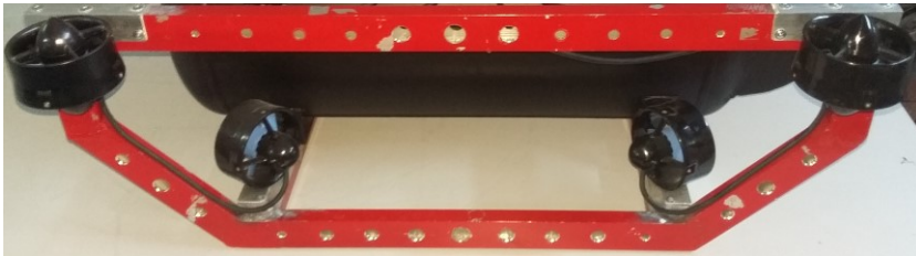
Fig. 9. Front view - electric motors for moving

The robot moves in a horizontal or vertical direction with 4 electric motors on each direction (Fig. 9).