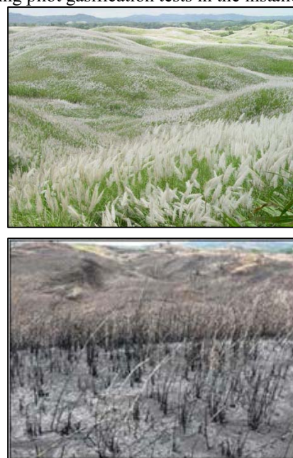
Fig. 1. Extensions of land infested with straw and exposed to forest fires [10].

the material was carried out with the intention of conducting pilot gasification tests in the installed reactor.