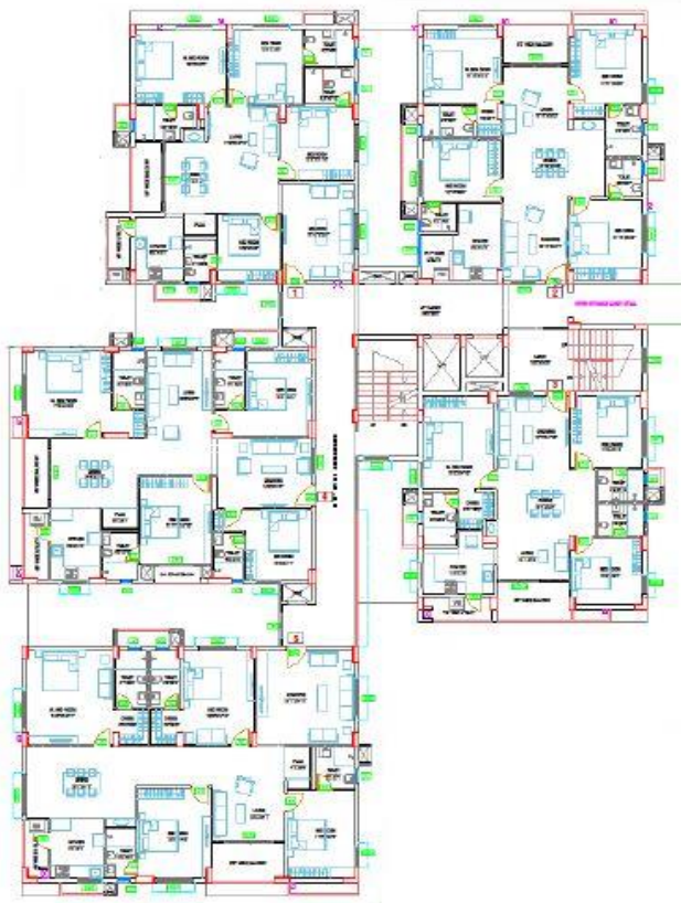
Fig 2. Plan of building