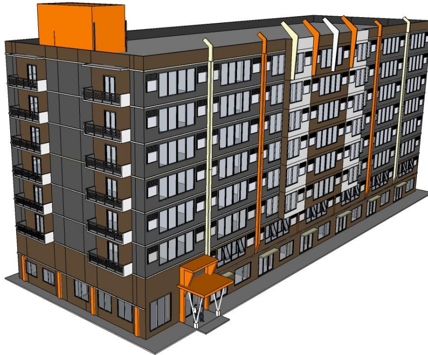
Fig. 1. Overview of case study building.

The factor that significantly affected the performance of the rooftop PV system is weather condition. The weather data in Bangkok from the Thai Meteorological Department in term of monthly average temperature and solar irradiance is shown in Fig. 3 and detail data that include relative humidity, precipitation, and wind speed is shown in Table 1.