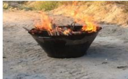
b) during burning.