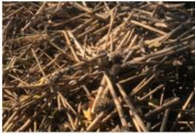
a) bamboo scraps.

Bamboo scraps and hardwood chips discarded (Figure 1.) were collected, exposed to the sun for 48 h to dry and reduce humidity and then burned in a cone-truncated open fire kiln (Figure 2.). The temperature was measured by Infrared Thermometer (DT8011H). The pH and moisture level were measured by Soil pH and moisture tester (Takemura DM-15). Pyrolysis conditions occurred at the absence of oxygen 500-700°C for 45 min to 1 h, then the burning output was taken to study the chemical properties and used as nutrition medium for planting.