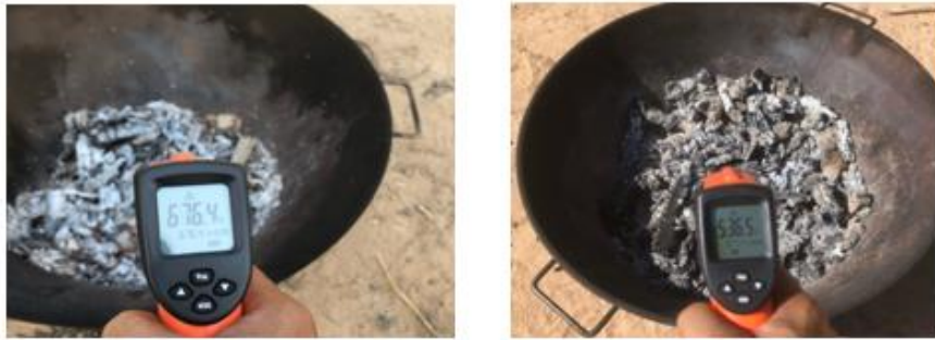
a) hardwood chips.

Burning Temperature results are shown in Figure 3. The temperature from hardwood chips and bamboo scraps are 676.4 and 536.5°C. The burning temperature of hardwood is higher than bamboo.