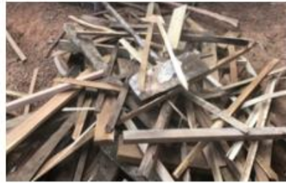
b) hardwood chips.