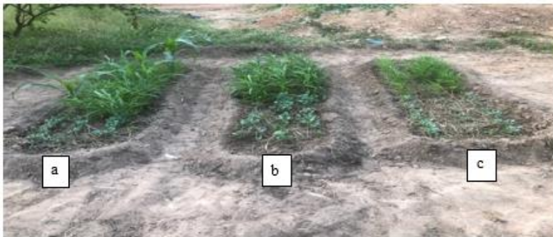
a) soil mixed with compost and biochar b) soil mixed with compost c) ordinary soil

The biochar for soil nourishment obtained from hardwood chips was taken to be mixed with the planting soil for experimental planting seedlings in the plot to find out planting results from ordinary soil, soil mixed with compost and soil mixed with compost and soil-nourishing biochar. As shown in Figure. 4-5., the soil mixed with biochar from hardwood chips can help to nourish the soil for plants to grow better than the ordinary soil and the soil mixed with compost since the pH of the mixture is more than 7 and higher moisture. The experimental results are in accordance with previous research.