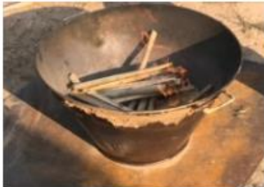
a) starting burning.