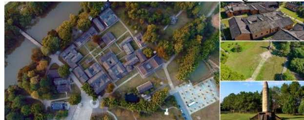
Fig1. Sampling of aerial images of the site of the Red Revolution

of modeling needs to obtain accurate structural data or image morphology of Soviet revolutionary sites under the visual three-dimensional model production of 3ds max software. For example, the structural data and image shape were mainly completed by surveying and photographing in the making of the three-dimensional model of the former site of the first Soviet Congress (Xie Family ancestral Hall). In addition, the shooting of the structural image of the site is mainly through the on-site return and fixed-point patrol of DJI Mavic Air to obtain the 4K high-definition image structure of the site to meet the needs of model production, as shown in figure 1.