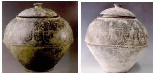
(a)Original cultural relics (b) Restored cultural relics