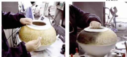
(c) Wipe off the surface half dry (d) Inkjet on black background