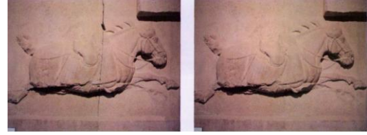
Fig.1. Comparison before and after the virtual repair of cracks using the variational PDE repair model