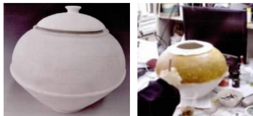
(a)3D printed pottery (b)Apply a layer of blended loess

Take a ceramic jar cultural relic restoration as an example, the specific process is shown in Fig.3. The effect comparison before and after repair is shown in Fig.4.