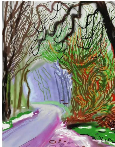
David Hockney paints with iPad

painting, advertising, architecture, digital illustration, animation and other art fields.