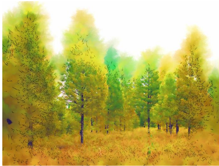
Digital watercolor material Autumn Forest