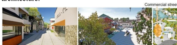
Figure.5. Design sketch of the architectural image reproduction scheme

cornice, and davit shall be kept generous and tidy as far as possible. Through the deep excavation of local architecture, bamboo weaving skills, celadon modeling, and other aspects of Longquan, as well as refining and simplifying on the traditional basis, combined with the original nature of local culture, the design pursues the transformation of form to make it have a modern style. The local common tiles, broken porcelain, yellow clay, red brick, green stone slab, and bamboo strips are selected to present the local architecture with natural and simple texture and artistic decorative aesthetic feeling, reflecting the irreplaceable nature of local culture in architecture.