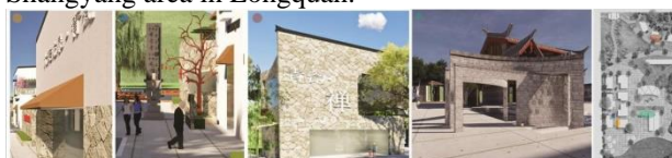
Figure.6. Design sketch of representation of the cultural image

Cultural image is a kind of specific cultural symbol, which can be presented with the help of specific design representation. In this scheme, landscape sketches, exterior wall decoration, ground pavement, entrance image, text symbol are all used to express the Celadon culture, bamboo culture, and architectural culture of Longquan. In terms of landscape color, the main tone is green, white, earth red, and mud yellow. Materials that can reflect the simple and elegant texture are selected to strive for the simple and implicit characteristics of the Shangyang area in Longquan.