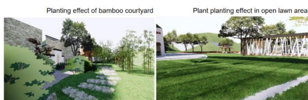
Figure.4. Effect of plant planting