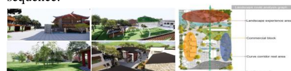
Figure.2. Landscape route analysis

The whole landscape route is orderly unfolded by taking "the main entrance - Qushui square - tourist center - still water scenery - Art Museum - water viewing corridor landscape" as the axis; taking commercial block, curve corridor rest area and landscape experience area as three centers, namely, "one axis and three centers", presenting a spatial effect with both traditional culture charm and modern landscape interest. The entrance adopts open design, with landscape sketch and ground pavement for space guidance to distinguish different path selection. Tall trees are planted on both sides of the road to increase the sense of hierarchy of space, and different paving materials and landscape devices are used to make the path continue and distinguish. In the landscape experience area, gallery roads and curved corridors are used to guide the walking route and expand the spatial sequence.