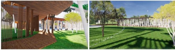
Figure.7. Design sketch of representation of the corridor-bridge image

New Vernacular Design[J], Journal of Lishui University, 2018(4), PP.97-101.