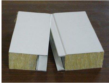
Figure 4: LCF board