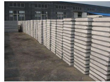
Figure 3: GRC composite exterior wallboard