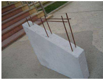
Figure 1: ALC board