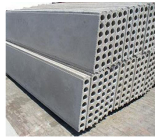
Figure 2: GRC lightweight hollow partition wallboard