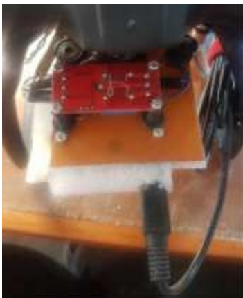
Fig. 5. Radio receiver added to anemometer for precise time data recording.

This data recording remote control receiver for data retrieval control, requires a voltage of 5 V and is taken from the drone battery after being reduced from 11.1 V to 5 V using a DC regulator.