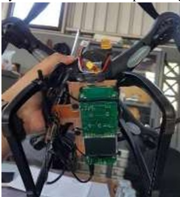
Fig. 3. Integrated anemometer below the drone.

For anemometer power supply users can get the power from drone battery. This process can save a weight of the prototype. Because the differences between the drone battery voltage output and current are different from anemometer Input voltage, users cannot just connect cable from drone battery to anemometer battery. The drone battery is 12 V and the anemometer battery is only 6 V. Users must add some resistor to compliance the problem. In this prototype, reserachers use a regulator to step down the voltage from 11.1 V output from drone battery to 9 V for anemometer input voltage. This process success step down the voltage of the drone battery to safe anemometer input voltage.