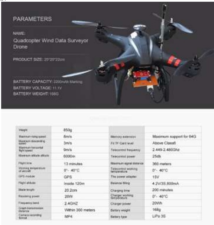
Fig. 2. Quadcopter parameters.

From preliminary flight testing, researchers found the battery life to be roughly 10 min in low-wind conditions, allowing enough time for data collection. However, the battery life is subject to change based upon wind condition and flight plan. Currently, the copter is controlled by remote with a feature to turn back home and following the pilot with usage of GPS.