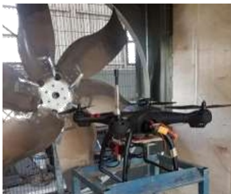
Fig. 6. Complete prototype of anemometer quadcopter surveyor drone.

This data recording remote control receiver for data retrieval control, requires a voltage of 5 V and is taken from the drone battery after being reduced from 11.1 V to 5 V using a DC regulator.