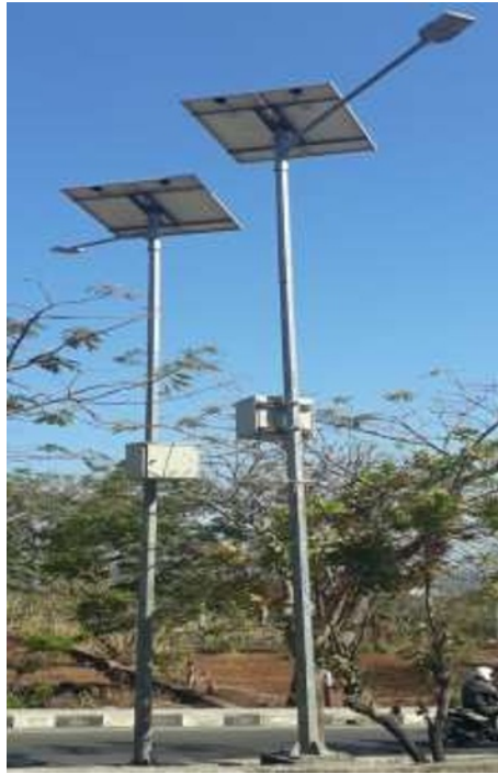
Fig. 1. PV streetlights in Kupang