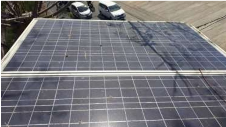
Fig. 3. Streetlight PV modules in dusty condition

To quantify the impact of dust, electrical parameters (short circuit current ( I_{sc} ), open circuit voltage ( V_{oc} ), and maximum power output ( P_{max} )) of the investigated modules were recorded in dusty condition. The modules were then cleaned and measured again as performed in clean condition. To get accurate results, measurements are made in similar condition. The modules were left to exposed to the Sun for a while before taking management in the clean conditions. The image of a PV streetlight in dusty condition is shown in Figure 3. As shown in Figure 3, shading was not only caused by dust but also by trees around the PV module area. In order to obtain more accurate results, the branches were cut before measuring the electrical parameter values.